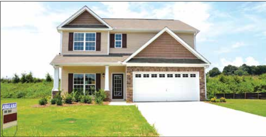
Demand for new homes in the Sacramento region remains extremely strong but it appears that sales are beginning to settle into a more normal seasonal pattern.