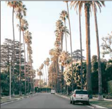
The average number of all daily car trips at the start of the pandemic dropped by 45% as COVID-19 and associated restrictions led to a drastic drop in road travel.

Daily Car trips: Fell from 3.2 pre-pandemic to 1.8 in April 2020, before rebounding slightly to 2.6 trips for the rest of 2020; Travel by Urban Areas: Daily trips dropped 42% (compared to 25% for those living in Suburban areas), before leveling off to a 20%-30% reduction; Travel by transit, taxi, or rideshare: The proportion of people who reported making any trips by transit, taxi, or rideshare plummeted from 5.5% pre-pandemic to 1.7% in April of 2020, before leveling off at approximately 2.4% for the remainder of the year; Commuter Travel: Work-related travel by all transportation modes dropped by 40% in April 2020, likely reflecting a mix of layoffs, job losses, and telecommuting. Commuting trips made by workers on days when they worked decreased by approximately 22%. For the remainder of the year, commuting trips were approximately 26% below pre-pandemic levels. Car fatalities rise despite less travel in 2020 Despite fewer cars on the road and more people staying home, the National Highway Traffic Safety Administration (NHTSA) recently estimated that 38,680 people died in motor vehicle traffic crashes in 2020 — an increase of about 7.2% over 2019 and the largest projected number of fatalities since 2007. The most recent AAA Foundation for Traffic Safety Traffic Safety Culture Index (TSCI) found that drivers perceive distracted, aggressive and impaired driving as