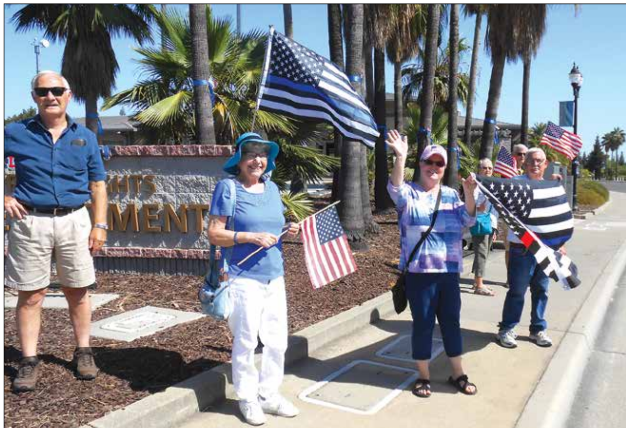
Community members, LEO, a non-political organization, and the Citrus Heights American Legion gathered to show support for Citrus Heights Police Department on Saturday, July 17, at 6315 Fountain Square Drive.

Flag Rally Draws Public Support and Solidarity for CHPD