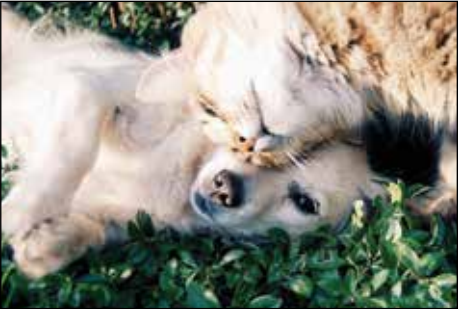
See who is available today for adoption at SSPCA.org/adoptable and help us spread the word!

Beginning Friday, July 2nd, the Sacramento SPCA is hosting a special