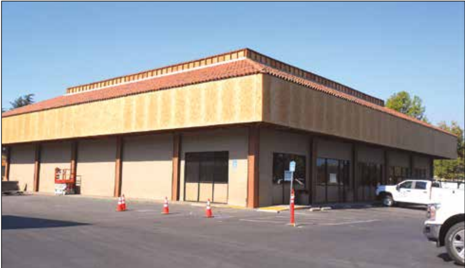
The retail building at 7830 Macy Plaza Drive in Citrus Heights is now under renovations to make it more marketable.