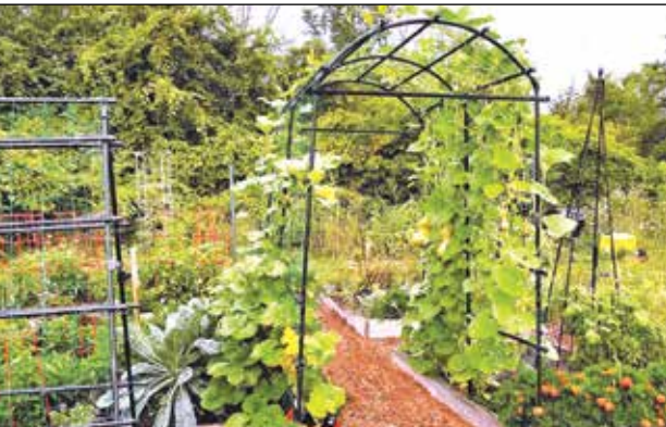
Incorporate trellises into garden plans so beans, peas, tomatoes and even squash can be trained to grow vertically.