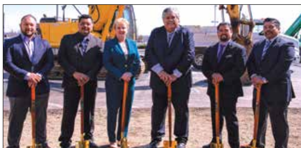
Members of the United Auburn Indian Community Tribal Council, Thunder Valley Executives and local elected officials, chambers and community groups gathered for a groundbreaking ceremony to commemorate the property's new 150,000 square foot state-of-the-art entertainment venue.

Once completed, The Venue will have 4,500 seats and host musical acts, comedic performances and sporting events, and will provide large event space for conferences and banquets.