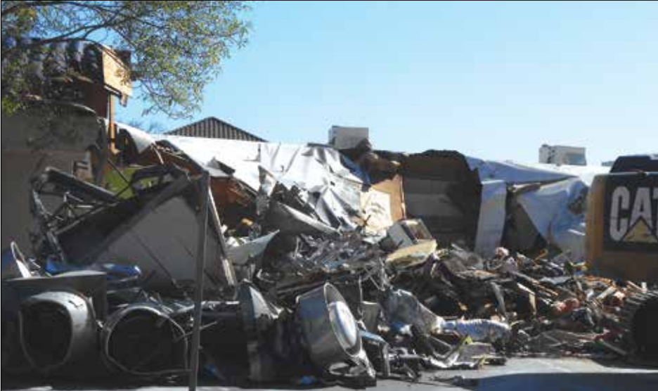
The complete clearing of the 17200-square-foot site formerly occupied by Benihana restaurant should be done by March 31.