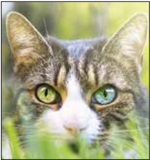
Barn Cats a “Green” Solution to Pest Problems.

By Allison Harris, Sacramento County News