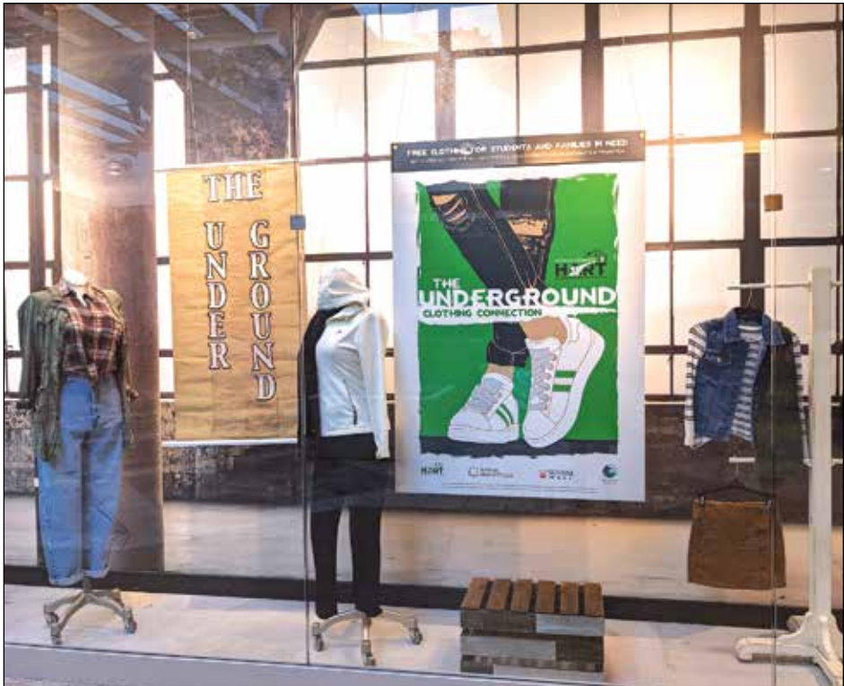
Sunrise Mall offered the former REI 21 space for the new venture at no charge.