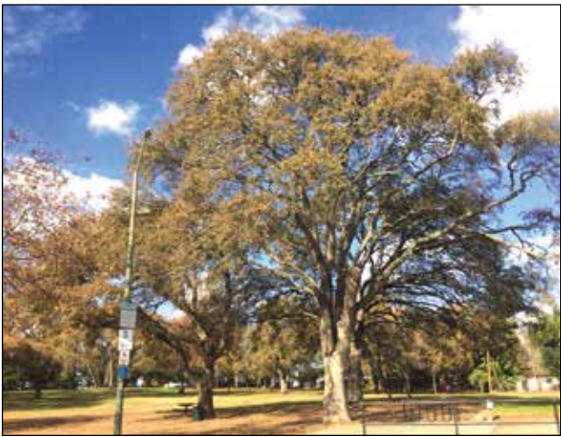
Above: The City of Citrus Heights with its beautiful tree scenery is located near the geographic center of the Greater Sacramento Area.

By Jackie Schmitt, City of Citrus Heights Communications Intern