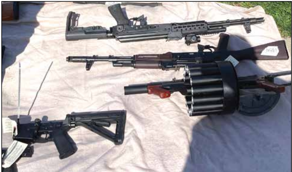
Image of several assault-style rifles and grenade launcher found at the Mission Avenue residence.