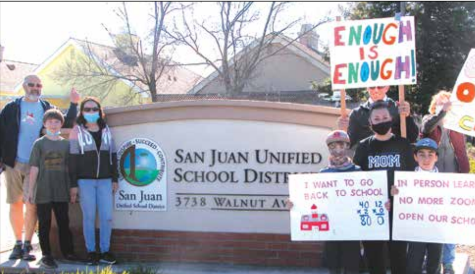
The Open Up SJUSD movement is pushing for students’ basic fundamental need to be back in school, in person.