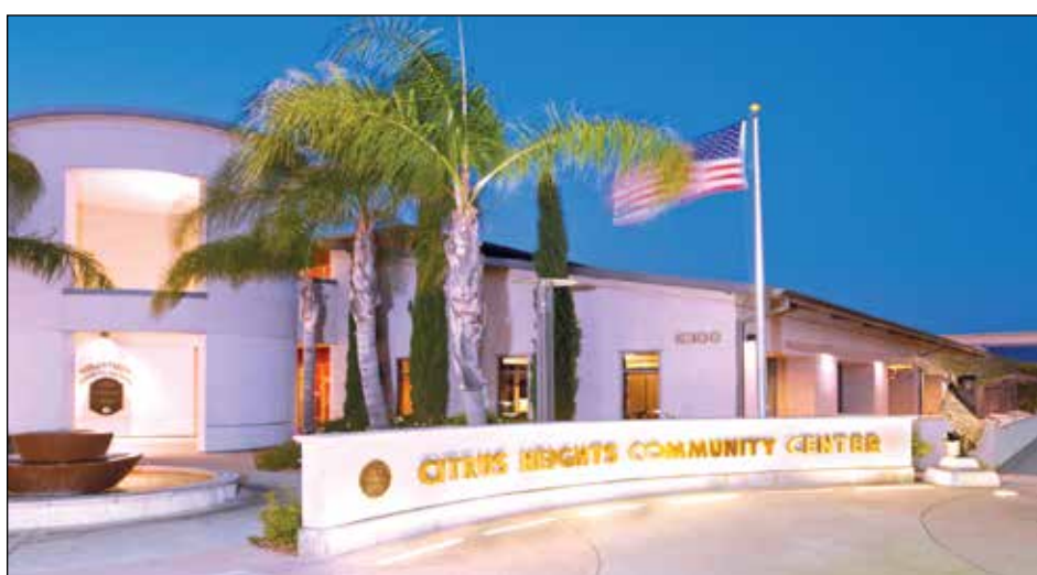
Although the Community Center remains closed for all publically in-house and in-person events, you can still rent the commercial kitchen for drive-thru fundraisers.