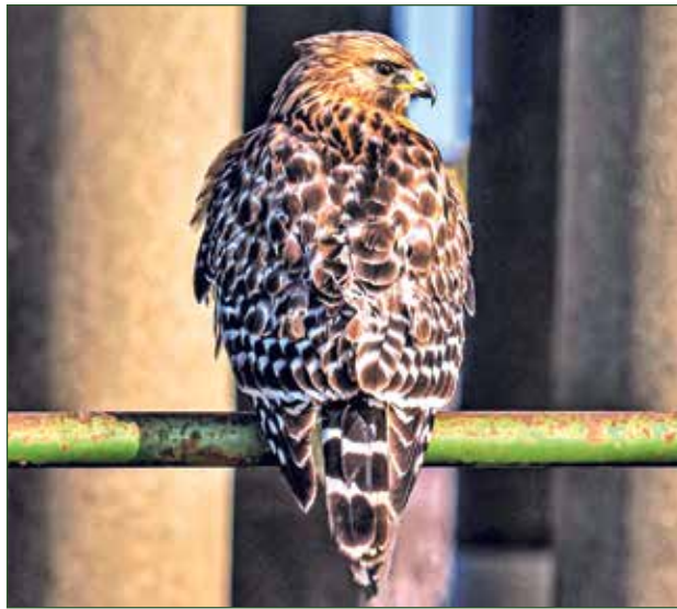
Winning photograph snapped of a red shouldered hawk by Jody Reese of Fair Oaks. Photo provided by WCAS

The annual Wildlife Care Photo contest seeks to promote outdoor activity, appreciation for nature and offer a unique view of the avian life in the Sacramento region. Contest entries begin on Oct 1st and continue