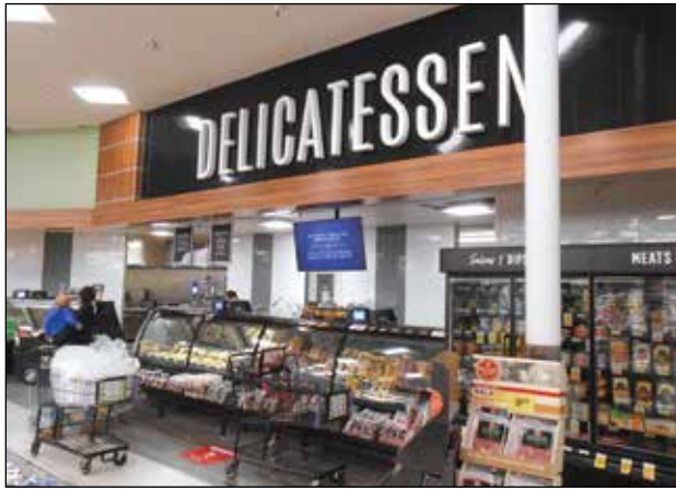
With the remodel came new digital screen displays throughout the store to help inform shoppers.