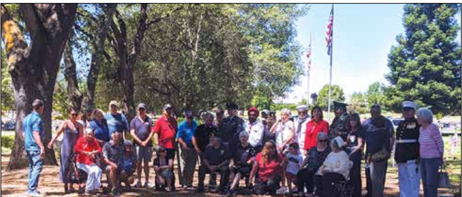
A small group was compelled to not let one year go by without saying ‘thank you’ to those who gave their lives for their country.