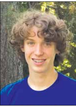
By Noah Howard

the roads to a standard that people would deem as “good,” we need an additional $65 million yearly. This tax would not even come close to generating the $65 million we need to get our roads to a “good” level, especially when you consider that nearly 40% of this tax would go towards a public transportation system that hardly anyone uses. The final step this tax needs to take to go onto the ballot is a vote at the Board of Supervisors on July 14th, but unlike the previous vote that needed a two-thirds majority to pass, this one only needs a simple majority. Assuming it passes, this will be on the ballot November 3rd for all voters of Sacramento County to officially vote on. Expect to hear a lot more about this issue from me and others between now and then. Thank you for reading – and as always, if you want to contact me, call me at 916-874-5491, or e-mail me at SupervisorFrost@saccounty.net. Sue Frost represents the 4th District, which includes all or part of the communities of Citrus Heights, Folsom, Orangevale, Antelope, Rio Linda, Elverta, Gold River, Rancho Murieta, North Highlands, Carmichael, Foothill Farms and Fair Oaks. ★