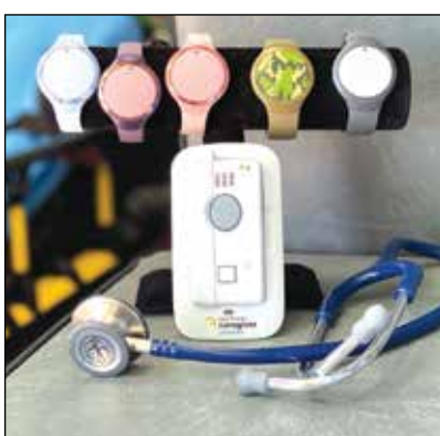
Electronic Caregiver Partners with AlphaOne to Provide Quality Emergency and Non-emergency Services to Seniors in Sacramento County.