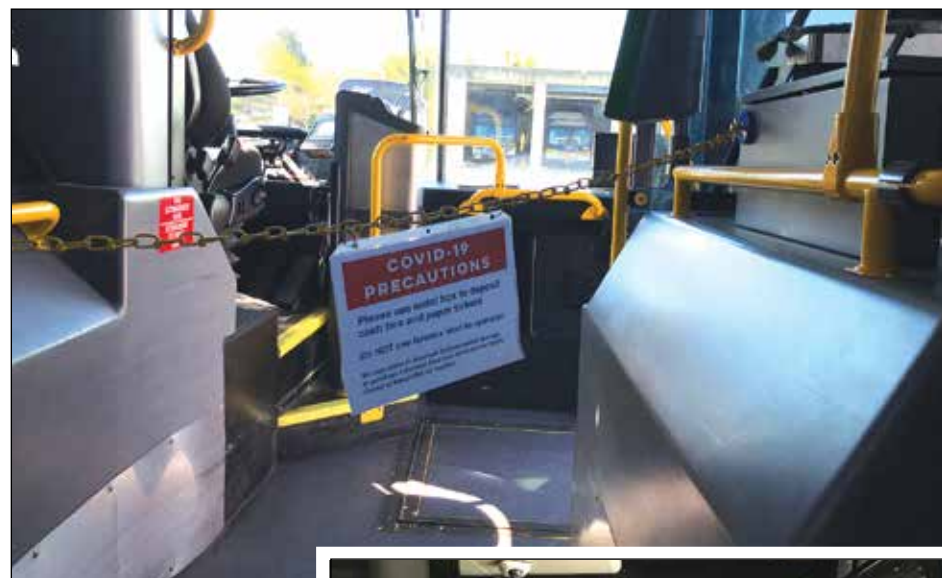
Above: A detachable chain barrier is used to reduce exposure between passengers and drivers. Right: SacRT is currently installing a protective plexi-glass barrier on each bus by the driver's seat.