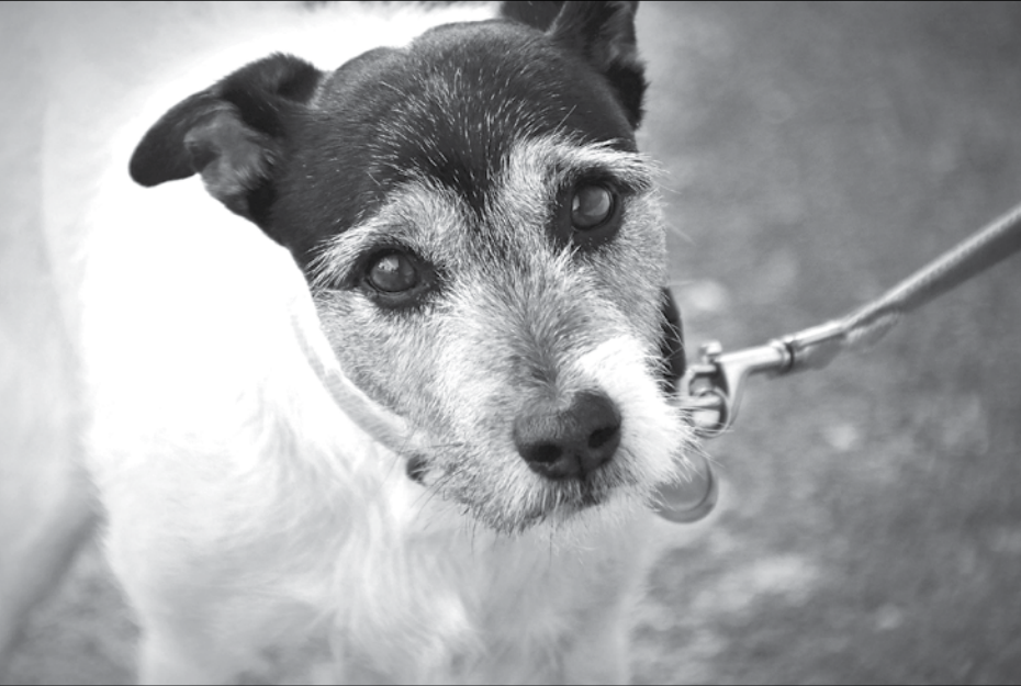
Come celebrate the amazing commitment of our community to healthy, happy and unconditional relationships between pups and their people!

to the Legislature. “His proposal to maintain forest management will reduce fuel to help prevent wildfires. Funding to harden homes will help secure houses and potentially save lives. “I agree with the Governor that money is not the solution to every problem. Providing shelter is only a small part of the solution to homelessness. “We must address health care, substance abuse prevention, mental health and job training. It is important to encourage opportunities with benchmarks for success. “Teens are quickly becoming addicted to nicotine. His support to ban flavored nicotine products will bring much relief to parents, teachers and administrators as they help students kick nicotine addiction. “The use of taxpayer monies to give full health benefits to more adults living in the country illegally is concerning. This permanent spending is costly and will compete with funding for other critical services when the economy shrinks. “I caution the Governor and lawmakers to ensure we achieve results for Californians, and not just spend.” Elected to the State Senate in January 2013, Senator Nielsen represents the Fourth Senate District, which includes the counties of Butte, Colusa, Glenn, Placer, Sacramento, Sutter, Tehama and Yuba. To contact Senator Jim Nielsen, please call him at 916-651-4004, or via email at senator.nielsen@senate.ca.gov . Follow him @CASenatorJim. Source: Office of Senator Jim Nielsen ★