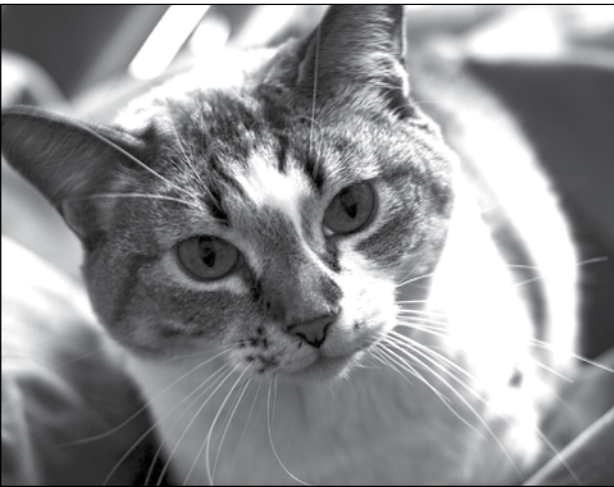
Why not adopt your new best friend or family member from the Bradshaw Animal Shelter?

SACRAMENTO COUNTY, CA (MPG) - Want a happy start to your new year? Why not adopt your new best friend or family member from the Bradshaw Animal Shelter? Adoptions are only $25, and we’ve already had our first adoption of 2020! Plus, adopting gives a shelter pet a second chance at a new life. Bradshaw Animal Shelter’s first adopted animal in 2020 is Gizmo, a 13-week-old Lynx Point Siamese kitten. Before arriving at the Bradshaw Animal Shelter, Gizmo was found without a mother or siblings, by a woman who would become his temporary caregiver through the shelter’s foster program. Gizmo lived in foster care from Oct. 24 until he was