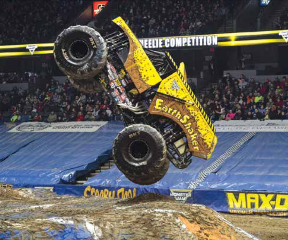
Earthshaker monster truck in an unbelievable near vertical aerial stunt.