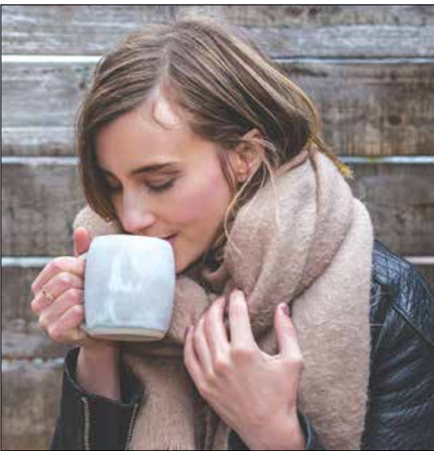
Winter-weather conditions and temperatures are upon us, now is a great time to review cold weather tips.

Insulate outdoor pipes that lead into your home to prevent freezing. Seal with caulk around the pipes that lead into and out of your home. Inside your home, leave the bathroom and under-sink cabinets open to