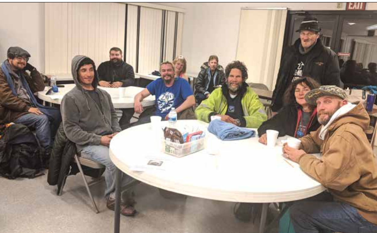
Guests of the first week of the 2020 Citrus Heights Winter Sanctuary program enjoy relaxation, refreshments and some good trivia before being transported to Fair Oaks Presbyterian Church where they will receive a hot meal and a good night's rest out of the cold and rain.