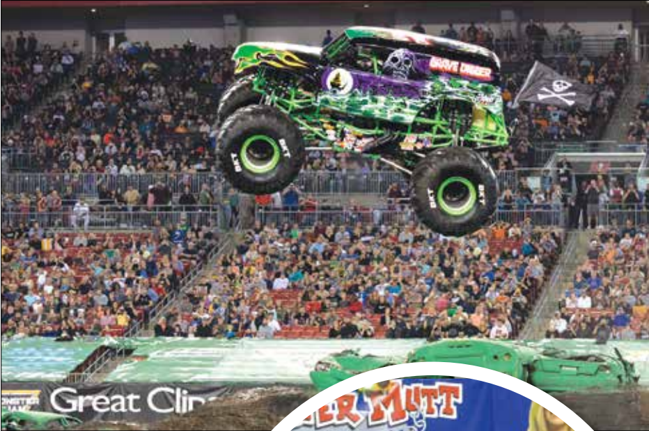
Above: The Gravedigger delivery monster truck will be making incredible flys through the Monster Jam® circuit. Right: The MJ Speedster is part of the Gravedigger team of high-flying action and four-wheel excitement.