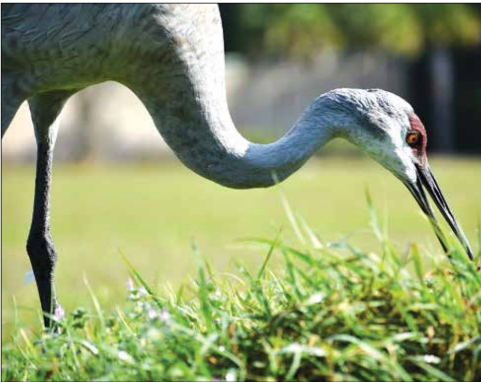
Of the six subspecies of Sandhill Crane found in North America, three can be found in California.