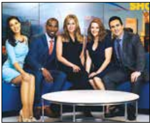
A nerve- shredding, perfectly paced finale that saw feuding news anchors Alex and Bradley (Jennifer Aniston and Reese Witherspoon) uniting on-air to take down the toxic men at the top.

for snubbing Succession after it thrilled us with the bravest second season ever. Ignoring HBO’s sharp satire and the insanely gifted ensemble of Jeremy Strong, Sarah Snook, Kieran Culkin and Brian Cox as a Machiavellian media family? Maybe SAG should be renamed SAD.