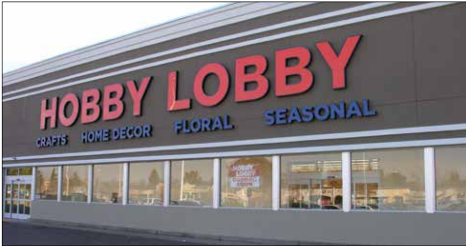
Frontal view of the new Hobby Lobby to open in Citrus Heights.