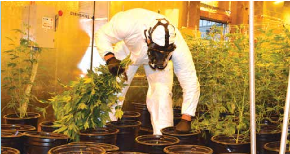
The Rancho Cordova Police Department is taking a proactive role in seizing illegal marijuana cultivations to prevent further illegal activity.