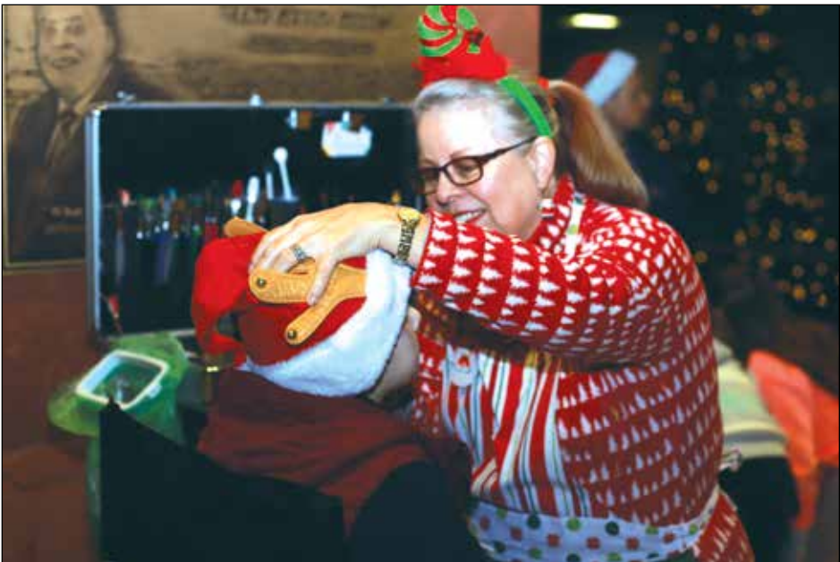
Decorating and adorning kids gets everyone in the spirit for the holidays.