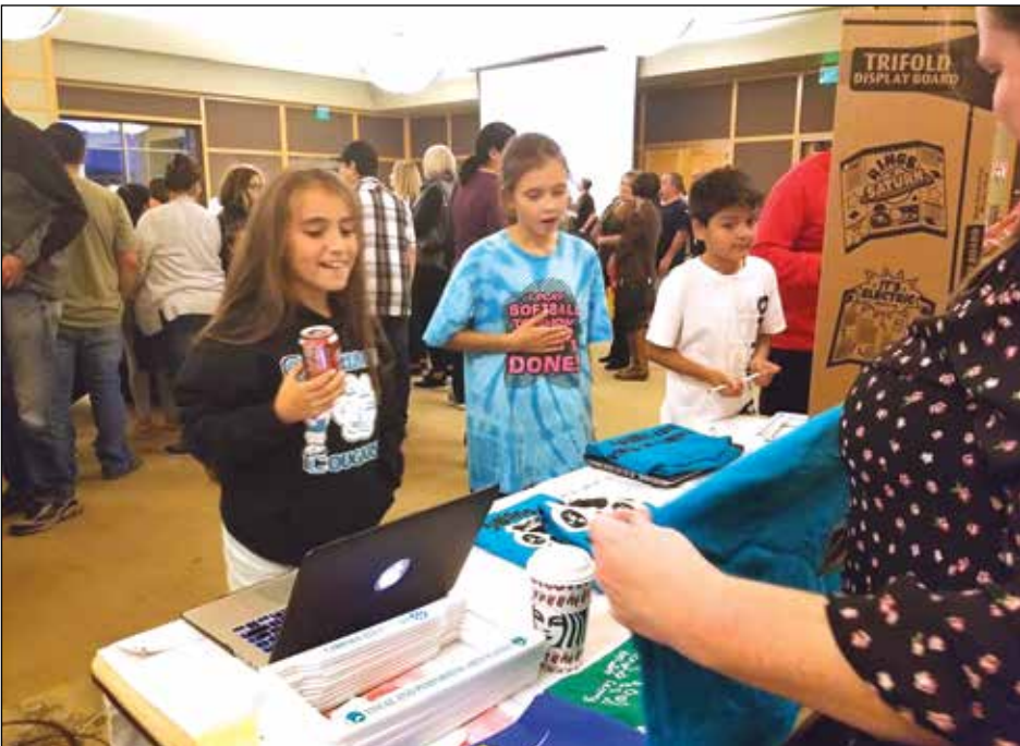
Kids get to see displays from various schools such as Carriage Drive Elementary.

"This is a great opportunity for families to kind of hit