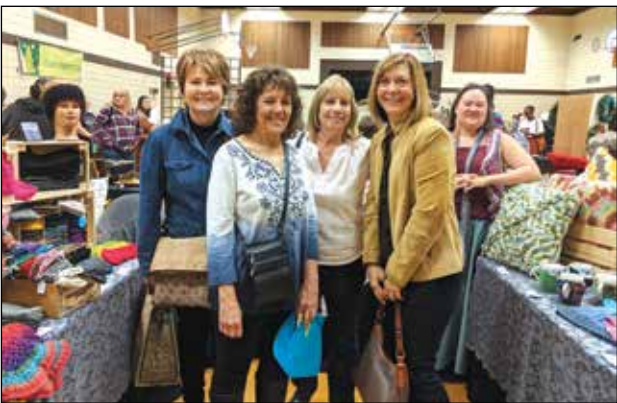
The Arts and Crafts Fair offered shoppers a variety of unique gift ideas for the upcoming holiday season.