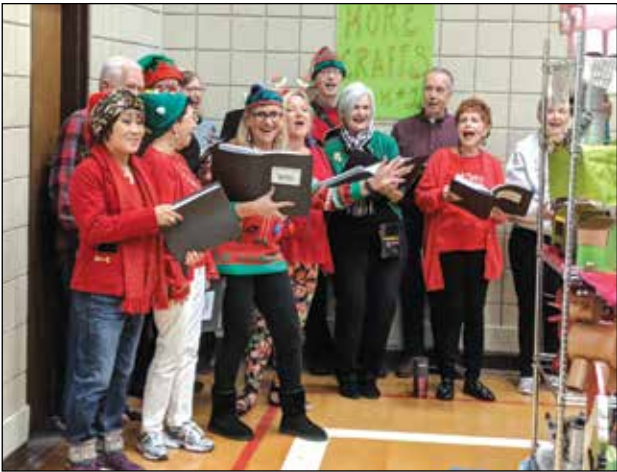
The Sunrise Community Church Choir helped kick off the holiday season with their performance of well-loved carols.

fund provides financial assistance to help eligible families participate in District programs and activities they couldn’t