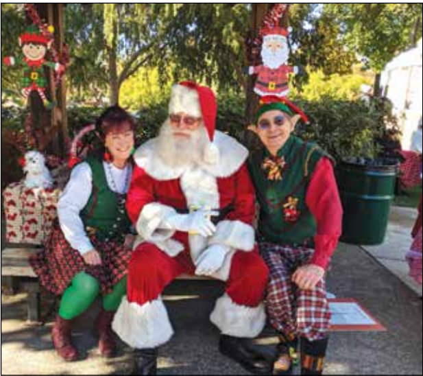
Santa and his elves visited Rusch Park for the holiday Arts and Crafts Fair.