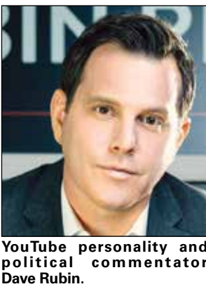
YouTube personality and political commentator Dave Rubin.

SACRAMENTO, CA (MPG) - The Sacramento State chapter of Turning Point USA will be hosting famous YouTube personality and political commentator Dave Rubin. Having built The Rubin Report, a channel with over 1 million followers and upwards of 200 million views, Dave Rubin has become a significant figure in the political world. He is famous for pushing the idea that “he didn’t leave the left, the left left him.” At Sacramento State, Rubin will be discussing the consequences of big tech censorship in the modern era along with the dangers of identity politics. As a gay married man, Rubin has been the victim of identity politics for not fitting in and knows how ugly identity politics are for being a classic liberal. For this reason, The Rubin Report celebrates free speech, civil discourse, and honest ideas. Dave Rubin will be speaking on the Sacramento State campus on Tuesday, November 12th from 7:30 – 10:00PM.