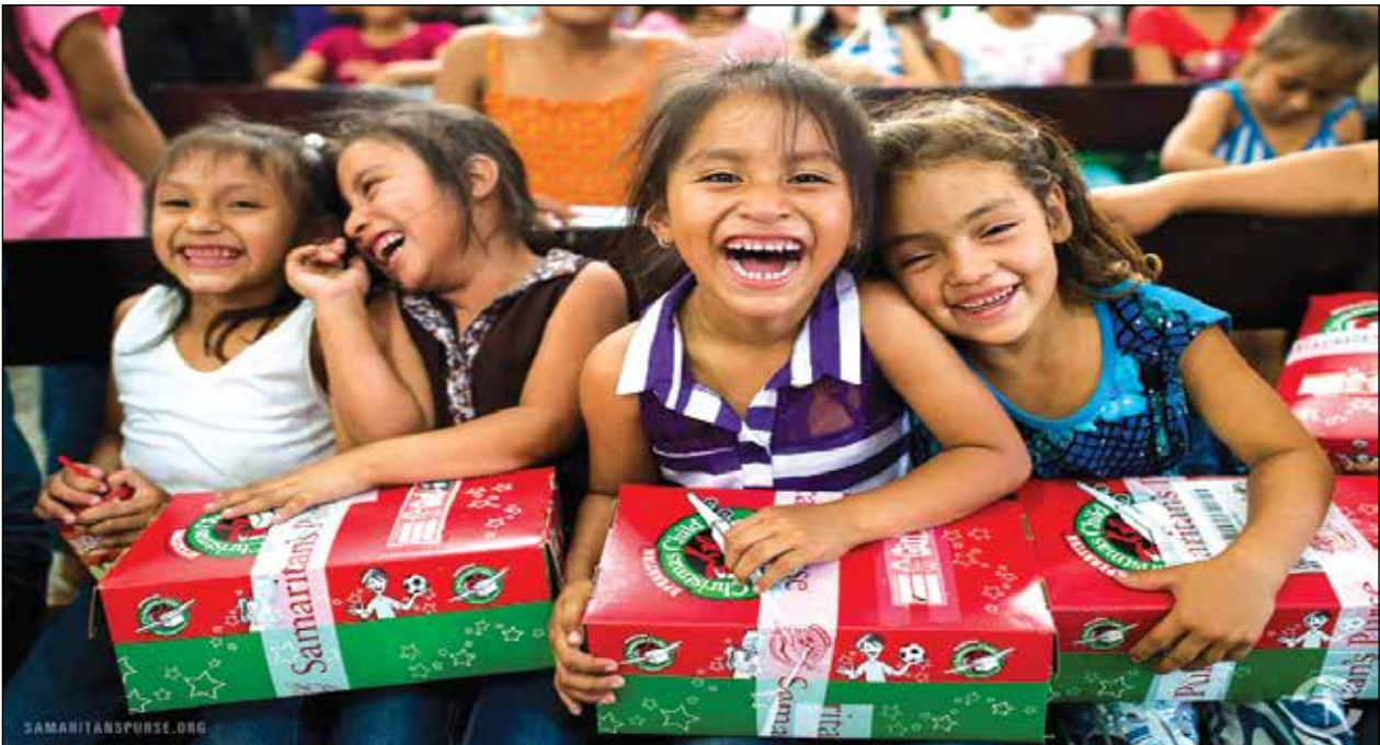
Children around the world celebrate the holidays but many families live in bleak poverty. You can change that with Operation Christmas Child.

By Mila Popov, Samaritan's Purse International Relief