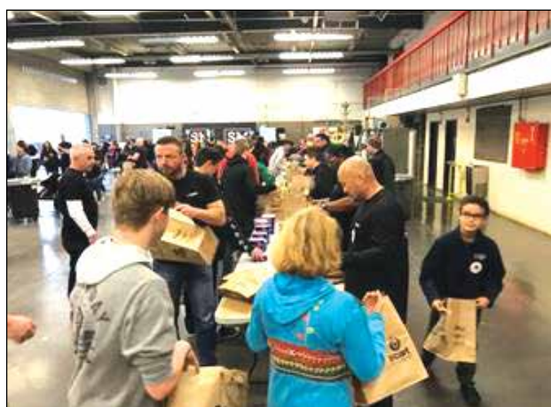
This is the 21st Thanksgiving SMUD employees and family members volunteering to prepare and deliver holiday dinners to the area's homebound seniors. About 150 SMUD Employees' Association volunteers spent Thanksgiving morning preparing, packing and delivering for Meals on Wheels.

Nearly 1,500 SMUD employees voluntarily participate in SEA, a