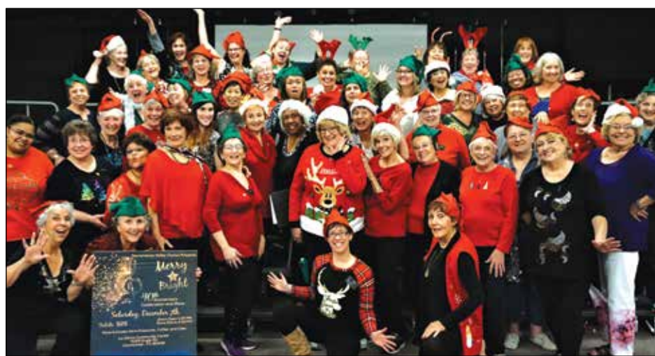
The Sacramento Valley Chorus includes women who live in the greater Sacramento area and Placer, Nevada, Yolo, San Joaquin, Yuba, and El Dorado counties.