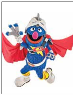
The beloved staple of educational kids' TV was suitably celebrated with a lively, loving anniversary special hosted by Joseph Gordon-Levitt that would make creator Jim Henson proud...and Grover (pictured) feel super.

Jeers to The Morning Show for anchoring Jennifer Aniston and Reese Witherspoon (with Aniston) with a tired trope. Apple TV+'s #MeToo drama could be a timely tale of female empowerment but is so far