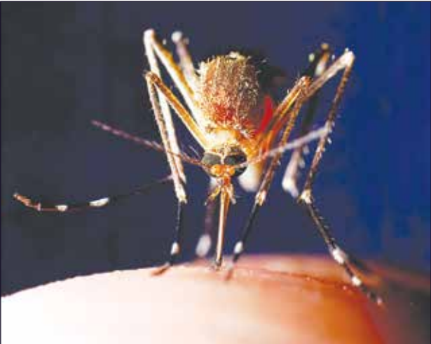
West Nile virus activity in the state is increasing, so it is important to take every possible precaution to protect against mosquito bites.

West Nile virus is influenced by many factors, including climate, the number and types of birds and