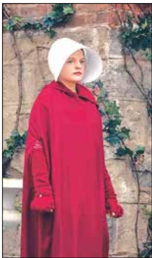
Elisabeth Moss, stuck in another male - dominated house while trying to save her child. Season 3 feels like it's spinning the wheels more than moving the characters forward.

Nickelodeon is planning a cartoon based on the YouTube video that's captivated kids with its repetitive ditty about a