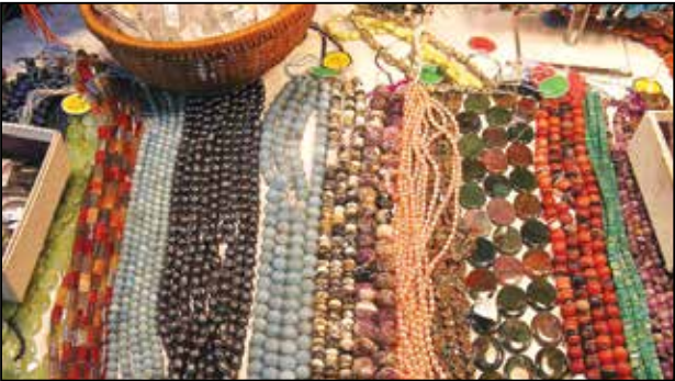
Beautiful, polished stones have been strung by hand in a variety of colors and sizes to create one of a kind necklaces for sale during the Gem Show (above).

ens of exhibits for attendees, such as jewelry, metal, wire and glass beading arts, fossils, crystals and minerals, but that's not all. So that attendees aren't rushed, the show also provides a cafeteria. "A very fine hot lunch is available at our own kitchen in Johnson Hall," states Hutchings. The group has put together a menu of very reasonably priced food and beverages will also be available at the