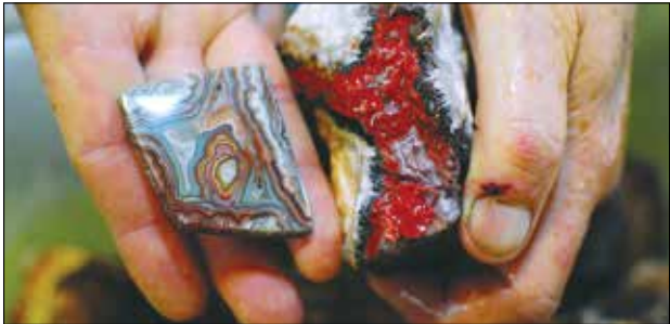
A "before" and "after" (left) sample of polished lace agate from Mexico, for sale at the Roseville Rock Roller's annual Gem and Mineral Show.