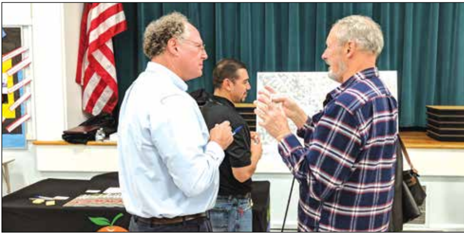
Local residents offer input on Citrus Heights' proposed Electric Greenway Trail Project.

City Hosts Open House for Electric Greenway Trail Project