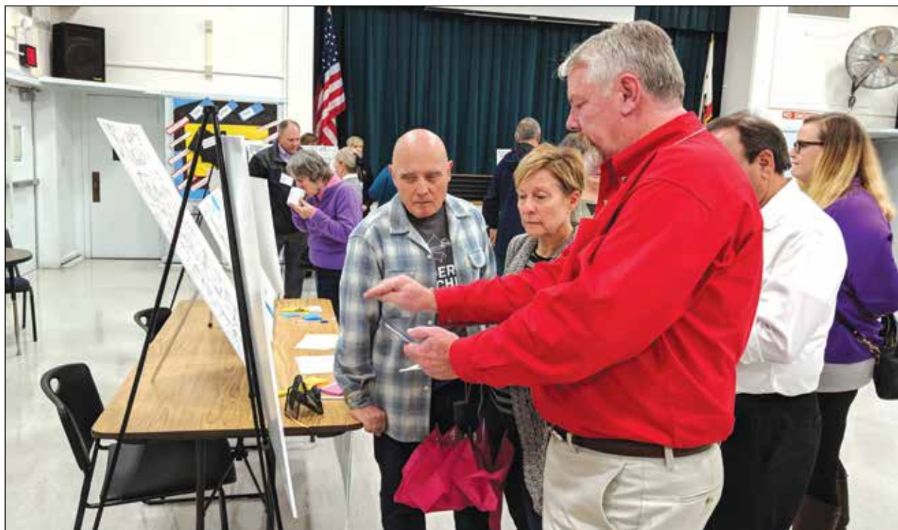
Many local residents attended an Open House for the Electric Greenway Trail Project, hosted by the City of Citrus Heights at the Sunrise Tech Center.

City Hosts Open House for Electric Greenway Trail Project