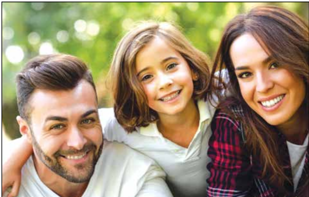
Counties throughout California are working to recruit loving families to care for foster children.

SACRAMENTO COUNTY, CA (MPG) - Counties throughout California are working to recruit loving families to care for foster children, but some families may feel they cannot afford to bring a foster child into their home due to budget constraints. To increase the number of foster parents and meet the needs of foster children, the Emergency Child Care Bridge Program for Foster Children was established for counties to help caregivers pay for child care until they find other subsidized child care or are able to pay for child care themselves. Introduced in January 2018, the Bridge Program aims to increase the number of stable, sustainable family placements for children in foster care. The program provides eligible caregivers vouchers to pay for child care. These vouchers help ensure that caregivers have adequate support to balance work and home lives and increase the likelihood of a smooth transition. In 2018-19, 46 counties opted in to receive a portion of the $31 million allocated to provide Bridge Program services. As of November 30, the program in Sacramento County had served 72 foster children in nearly 60 foster families. On December 11, the Sacramento County Board of Supervisors approved a nearly $500,000 increase of the Bridge Program contract funding to expand child care support services. The $1.3 million budget for Fiscal Year 2018-19 will be used to contract with Child Action, Inc., the local child care