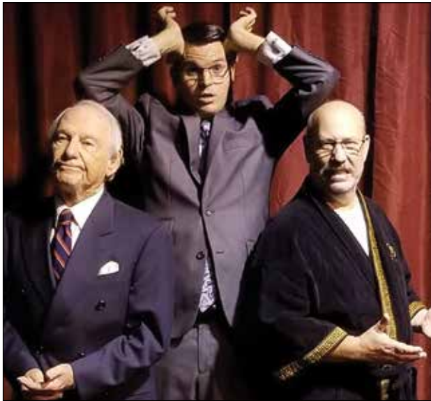
Come out and support your local theatre group.

Some of the reviews: "It's ham on wry...Simon's sure footed craftsmanship and his one liners are as exquisitely apt as ever." - New York Post; "Delicious and oddly affecting."