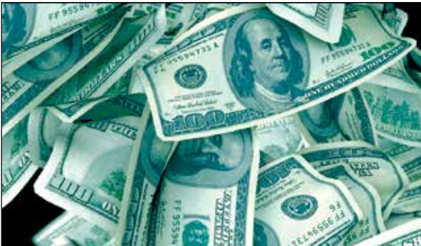
In order to file a claim on an uncashed check, claimant's name must be included on this list, or they do not have a valid claim.

To make a claim, call 916-732-7440 and supply the claimant's name, current address, telephone number and the address for the time period between October 1, 2014 and September 30, 2015. Claimants can also mail