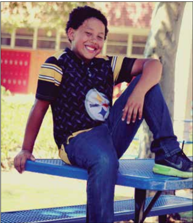
There are benefits of this program and there are drawbacks.