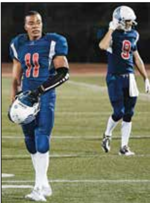
(Daniel Ezra pictured left) who's moved from the hood to the Hills of Beverly in teh CW program All American deserves to be a hit for ignoring the "teen drama" playbook.

For being dead wrong about what significant means. Before Season 10 began, producers teased that a "significant character" would meet his or her maker this year. So if Shelley Long's DeDe was so important, why did Jay's ex—who hasn't even been