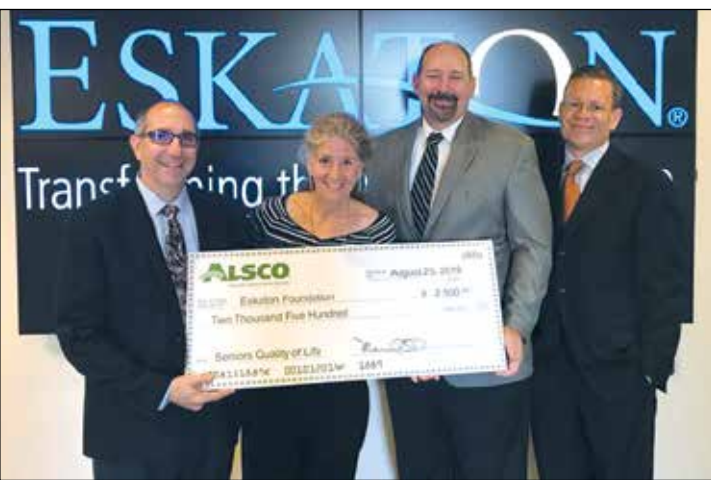
Eskaton management receives the donation from AlSCO executives.