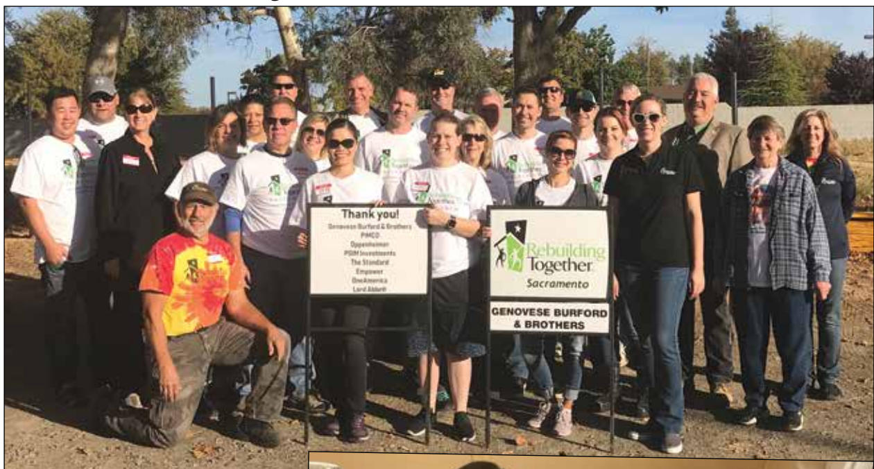
Rebuilding Together Volunteers joined in and got the job done. Upgrades included new flooring, fencing and storage facility.

With Backing from Genovese, Burford and Brothers