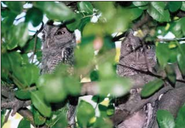
2017 Fall Photo Contest Winner from El Dorado County.

Each photo may be entered once, but individuals may submit more than one. Enter often and donate to help the WCA heroes of nature save thousands of injured, orphaned and displaced wildlife every year.