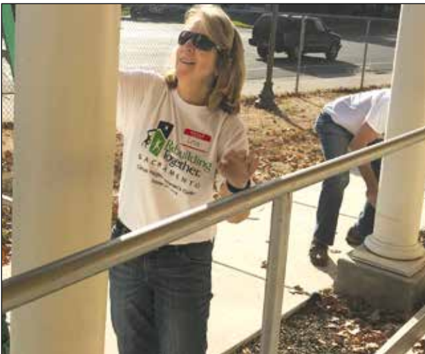
Today, the VCC is open weekdays and provides a space for socialization and support, with programs like craft classes, fundraisers and other opportunities for veterans to come together.

RTS is looking to provide additional upgrades to the VCC in the future with a grant from Sears.