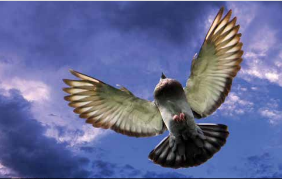
2015 Fall Photo Contest Winner from Sacramento County.