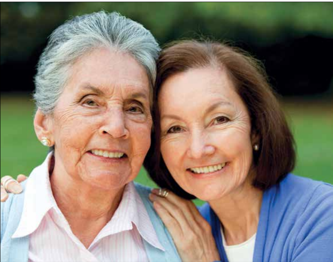
Everyone is eligible, pre-condition problems are covered, no waiting period.

Today there is a significant amount of local citizens over 50 years old that do not have any dental insurance, or if they do, their policies are extremely limited. It’s a problem and as an old dental saying goes, “Dental problems are a one-way-street. They never get better on their own and usually become more expensive” With early retirement, business cut-backs, Affordable Care California (Obama Care) and Medicare dental insurance doesn’t really cover very much. As the cliché says “60 is the new 40”. It means that people are living longer today, they’re healthier, and they’re enjoying life more. Yes we are enjoying life more and eating properly is