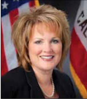
April 5th; Sharon Grove Assemblywomen

meet political leaders/candidates and learn more about issues vital to each of us. If you would like