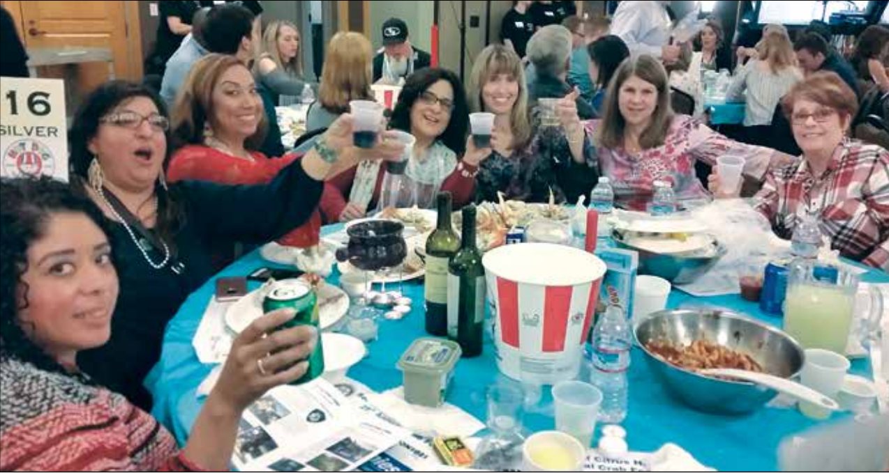
Employees & friends of Hot Dog on a Stick toast their good time at the Rotary crab feed at the Citrus Heights Community Center on July 11.

Crab Feed Fundraiser Reaches from Citrus Heights to India