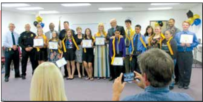
13 Graduate from "My Life," Citrus Heights Police Department's Youth Leadership Academy Page 2