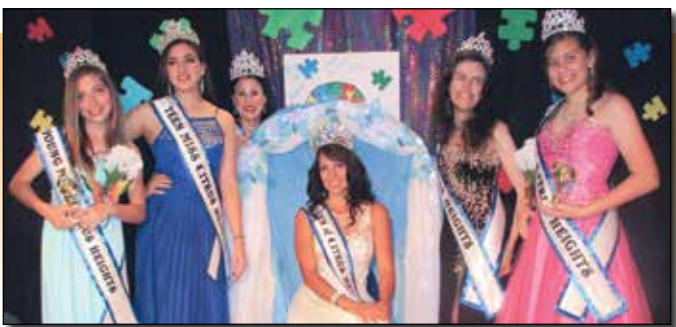
New Queens of Citrus Heights Crowned Page 8