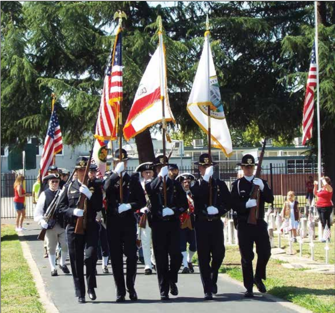
The Citrus Heights Police Department motorcycle brigade escort followed by the Color Guard and the Sons of the American Revolution, Sons of the Civil War, members of the American Legion Post 637, Boy Scout troop 228 and members of the public wound around parts of the cemetery.