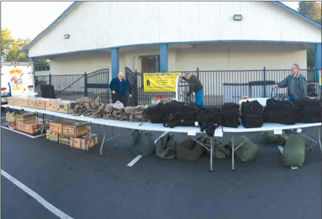
“Volunteers from the Church of Latter Day Saints set-up hundreds of Stand Down give-aways including jeans, jackets, socks, beanies and military grade sleeping bags and duffle bags.”

Local Homeless Veterans Get a Day of Respite at Citrus Heights Stand Down