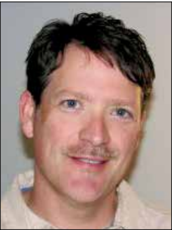
By Ronnie McBrayer

Even if one makes only a cursory reading of the Old Testament, that reading is sure to uncover the fact that ancient peoples were fond of building memorials. In the oldest of times, these places were called “gilgals.” A “gilgal” is a “circle” or a “wheel,” and these places were exactly that; circular campsites and memorials not unlike Stonehenge. A stone monument would be erected in the center of the circle and the community would gather at the outer edges for their rituals. Like our ancient forefathers, we too are fond of building stone monuments, modern “gilgals” that honor the past, and the past we are most quick to memorialize is our history of war. An index of major US monuments reads like a catalogue of conquest. From our revolutionary beginnings to our current international military campaigns, we have filled up the ground with the infinitely precious bodies of our youngest and most promising men and women. Case in point, visit our most iconic memorial of stone: Arlington National Cemetery. Hundreds of thousands have been buried there over the years, and it troubles me to say this, but it will reach capacity in only a few more decades. No, not everyone buried there is a war casualty, but all served in some capacity, and Arlington isn’t