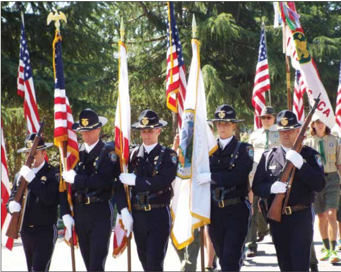
The Sylvan Cemetery Memorial Day service follows the traditional procession lead by Citrus Heights Police motorcycle officers and the Police Honor Guard, followed by Boy Scouts of America Troop 228, Sons of the American Revolution, and American Legion Post 637.