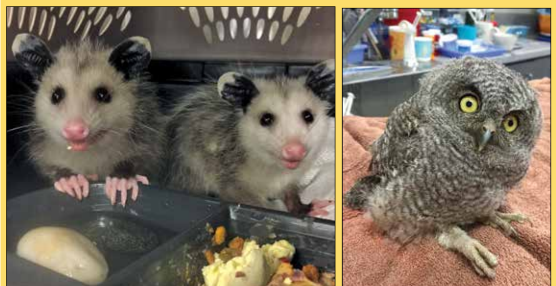
All types of injured birds and animals are sent to the volunteers at Wildlife Care Association, where they are cared for and released back to the environment.