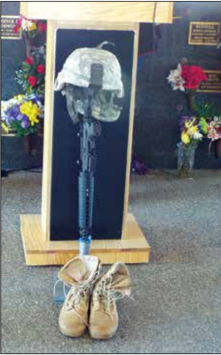
This memorial is the Fallen Soldier Battle Cross. The cross is made up of a deceased soldier’s rifle with its muzzle buried in the ground, helmet on top, dog tags hanging from the rifle, and the boots of the fallen soldier next to it.