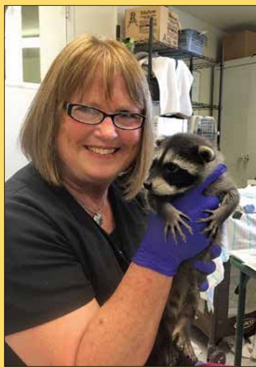
Caring volunteers at the Wildlife Care Association rehabilitate injured animals from across the region.

SACRAMENTO REGION, CA (MPG) - A stark contrast between obsolete high technology and urgent wildlife care will bring the non-profit Wildlife Care Association, SMUD, the Sacramento Tree Foundation, Southside Rental Equipment, and volunteers from the community to the former radar dome on the west side of McClellan Park. The old