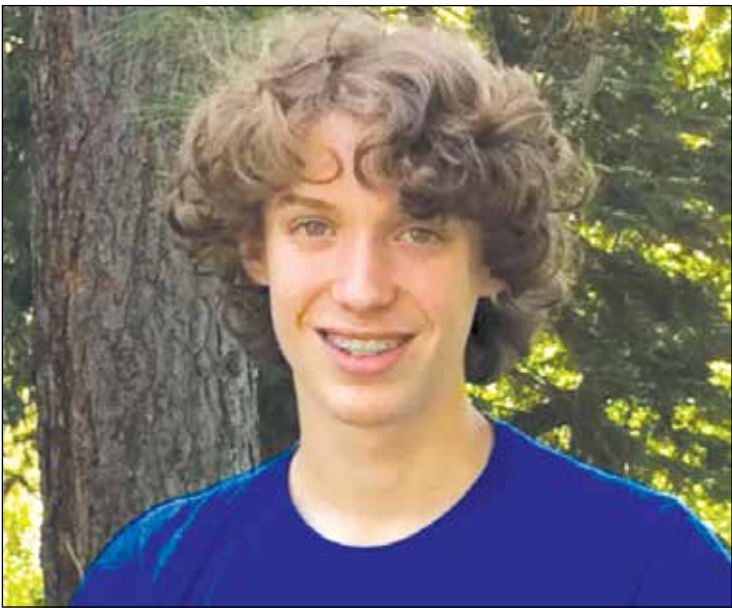
In a power-fantasy game like Wild Hunt , taking away power, and by extension fun, is a dangerous gamble that could impact sales and review scores.

Set in a medieval fantasy continent pitted in furious war, Geralt, the player-controlled monster hunter, runs into frequent opportunities to aid locals, kill creatures, and help one warring faction over the other. Wild Hunt ensures that the effects of each choice are shrouded in ambiguity. The player has to squirm, thinking through all possible consequences before selecting one of the few available