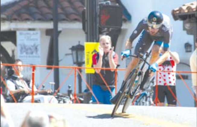
Eventual Amgen Tour of California winner, Sir Bradley Wiggins heads out at the start of his Time Trial in Old Folsom.

Mark Cavendish of Omega Pharma-Quick Step, the 2012 World Champion who holds the third most Tour de France stage wins, was able to lunge over the