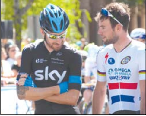
The Sir and The Manx Missile. Sir Bradley Wiggins of Team Sky discusses Time Trial strategy with the Mark Cavendish, also known as the "Fastest man on Earth."