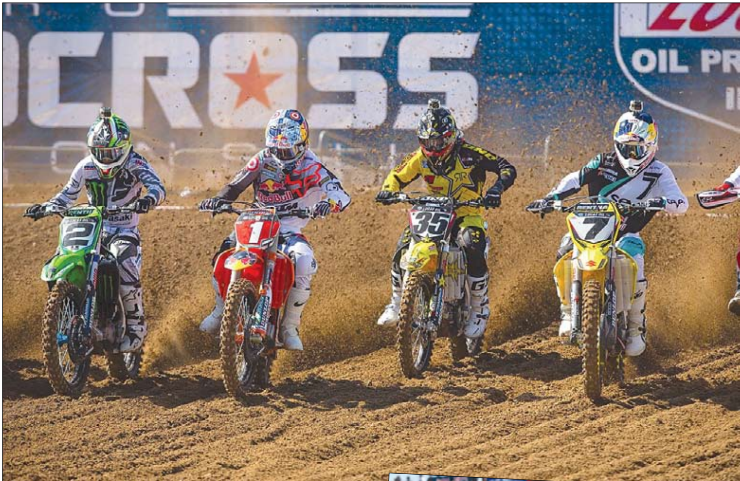
Photos in clockwise order from top: 450 class motocross start; Ken Roczen (moto 2 450 class practice) and the 450 moto podium.

SACRAMENTO REGION, CA (MPG) - No race is like it in California. The 46th Annual GoPro Hangtown Motocross Classic is back at Prairie City State Recreation Park Thursday, May 29th-Saturday, May 31st, with the pros racing on Saturday.