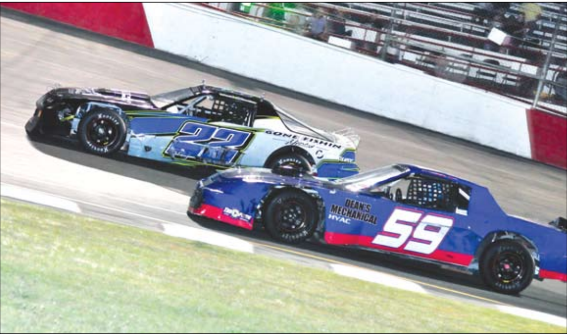
Before they were Superstars in the NASCAR Sprint Cup Series, Denny Hamlin, Kevin Harvick, Carl Edwards, Martin Truex, Jr., Dale Earnhardt Jr., and many more were like so many hundreds of thousands of drivers that make up the foundation of NASCAR.