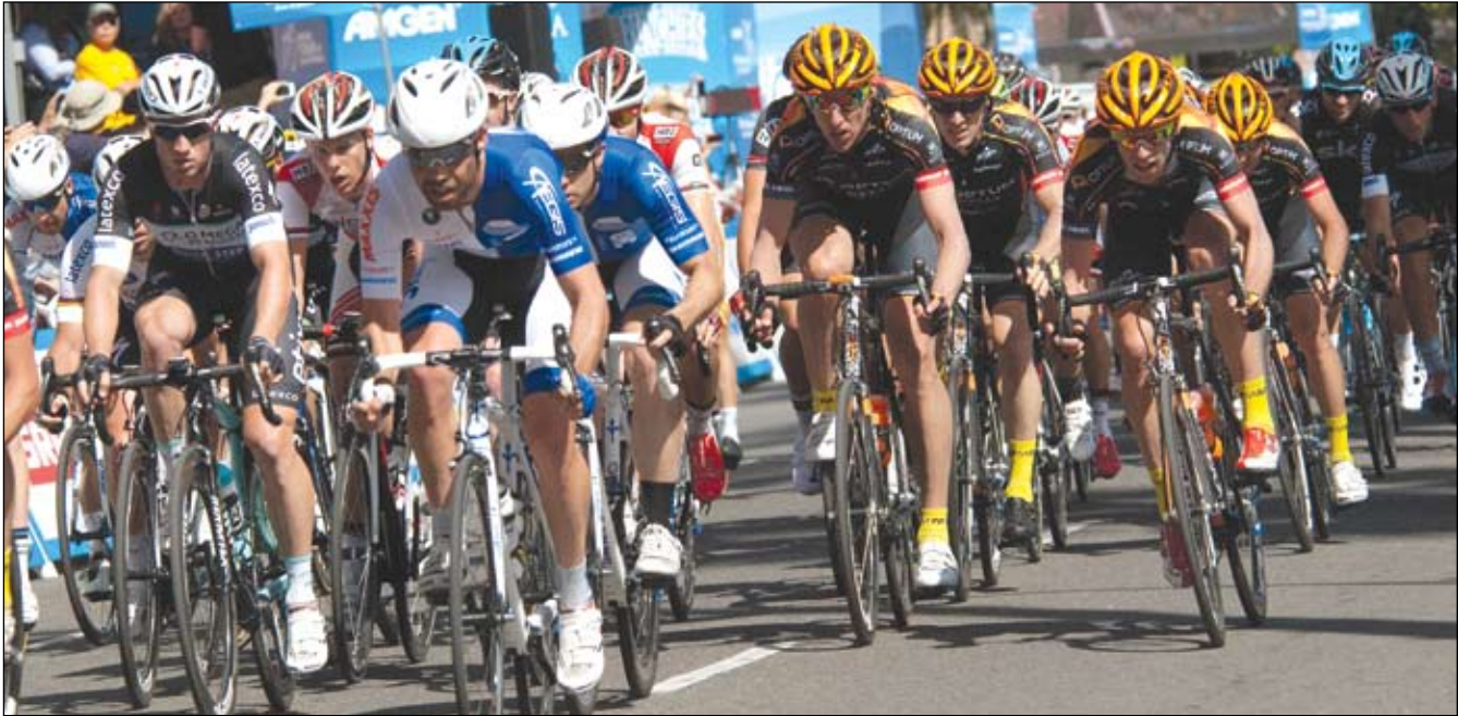
Coming to the start line for Stage one were 16 teams which included nine UCI Pro Teams, three UCI Pro Continental Teams and four UCI Continental Teams. Here we see the finishing laps of Stage 1 in front of the State Capitol.

The men's teams began the 720+ mile week long journey through California with a 123 mile road race starting and finishing in front of the State Capitol. The course took riders north along the Sacramento River, heading to Lincoln for the first of two sprint points of the day. The next sprint point came in Auburn