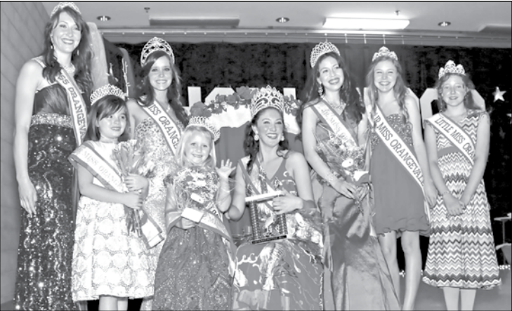
The outgoing and new Miss Orangevale pageant winners.