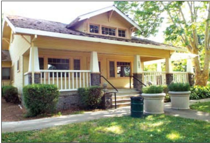
The historic Rusch Home and Gardens. The gardens are open to the public until dusk.