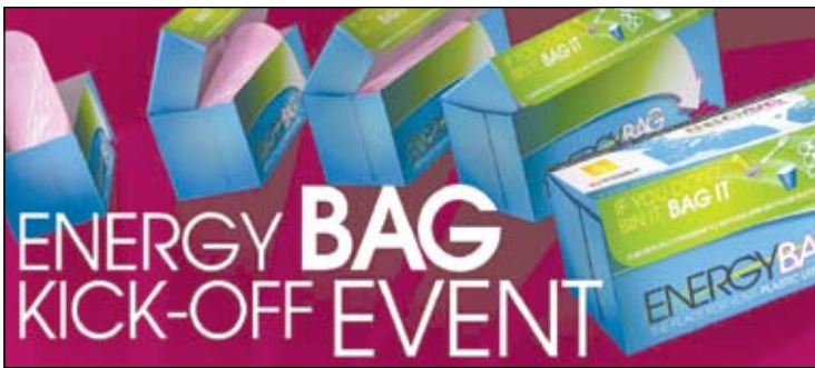
The City of Citrus Heights officially kicked off their three-month Energy Bag pilot program to convert non-recycled plastics to energy with a public event Saturday, May 17 th on the City Hall grounds.

The summer-long program will ask approximately 27,000 Citrus Heights households to separately collect plastic items not currently eligible for recycling in the city. These items include juice pouches, candy wrappers, dog food and cat food bags, frozen food wrappers, outer wraps for water bottle or soda packages and even plastic