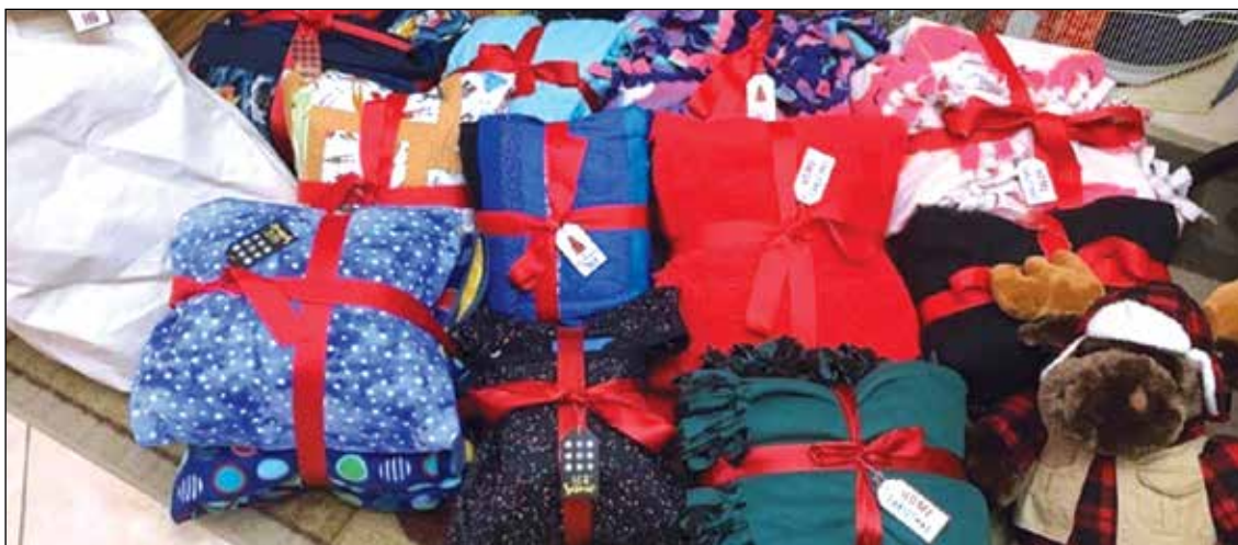
In 2021, the program provided gifts to more than 2,500 youth, adults and seniors at an estimated cash value of $152,040. And the look on gift recipients' faces? Priceless.

They got Nerf balls, art supplies, scented candles, Disney princess toys, basketballs, Bluetooth speakers and more! The youngest recipient, Karl, age 1, received finger puppets, wooden puzzles, and a Lego train. The oldest, Quang, age 91, received