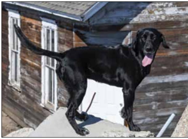
Shelter dog Dora now serves in the National Disaster Search Dog Foundation (NDSDF).

way to their happy ending. Foster care providers provide temporary care outside of the shelter to animals such as those too young for adoption, needing to recover from an illness or injury, for behavior modification, or just because they need a break from the stresses of shelter life. Rescue group partners are also a huge help as they pull shelter animals who otherwise have a difficult time being adopted due to age, medical condition or the need for behavioral modification that cannot be resolved in a foster home. Shelter dog Dora, who arrived as a stray in 2016, was having a difficult time finding a forever home.