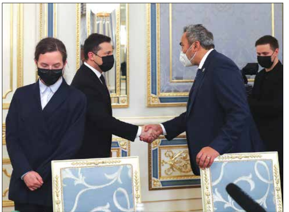
I met with Ukrainian President Volodymyr Zelensky in February to reaffirm the United States strong commitment to the Ukrainian people in the wake of Russia's unprovoked invasion.

From the Office of Congressman Ami Bera, M.D.