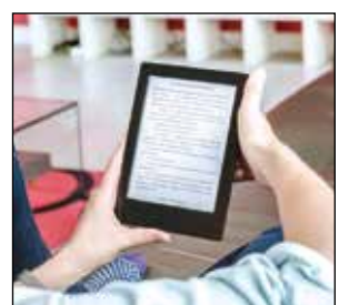
This milestone illustrates the continued growth and demand of library services including digital lending of ebooks and audiobooks.