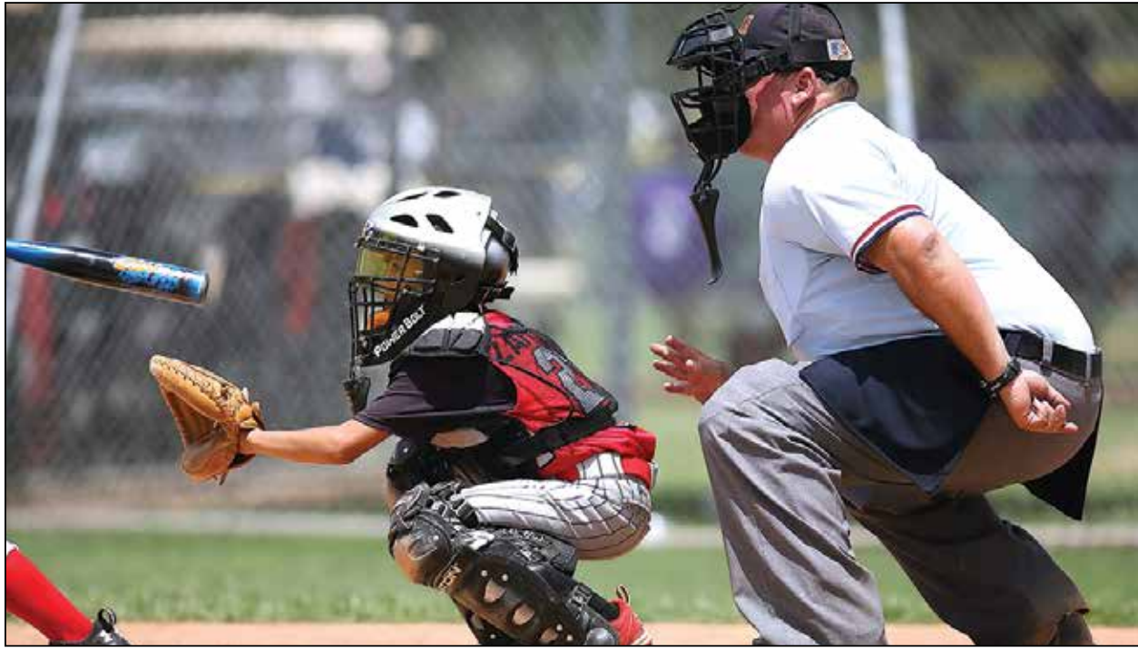
Becoming an umpire is easier than you might think. Knowledge of the game is not required, but it does help. All you need to do is sign up for umpire clinics that are offered by local little leagues and softball leagues.