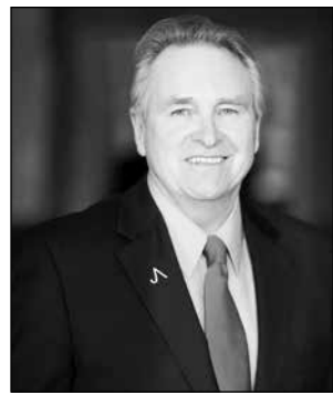
Office of Senator Jim Nielsen

SACRAMENTO, CA (MPG) - Senator Jim Nielsen, R-Red Bluff, issued the following statement in response to Governor Newsom's proposed 2022-23 State Budget: