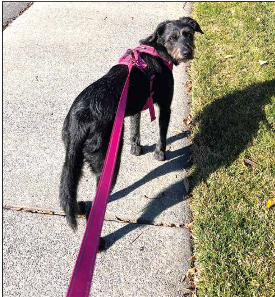
Even a nice, quiet walk with the dog isn't safe from surreal human interaction these days.

"My dog can be ornery," the woman said just seconds before our pets would have their close encounter of a furry kind.