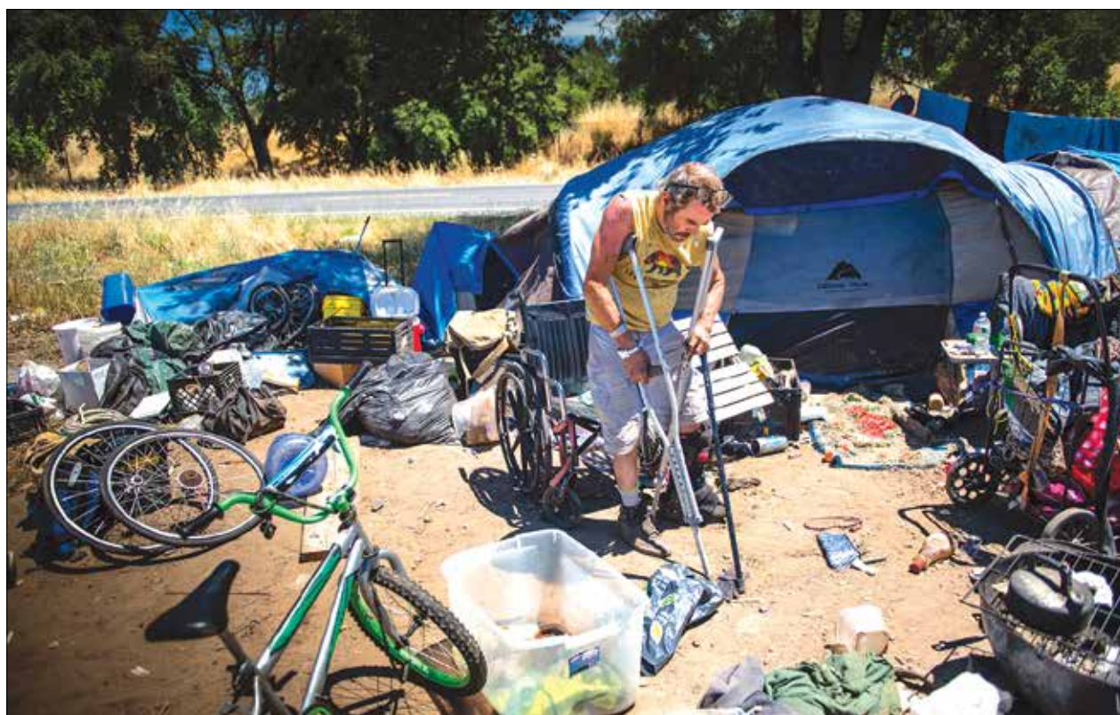
Census data helps government take into consideration the needs of its constituents.