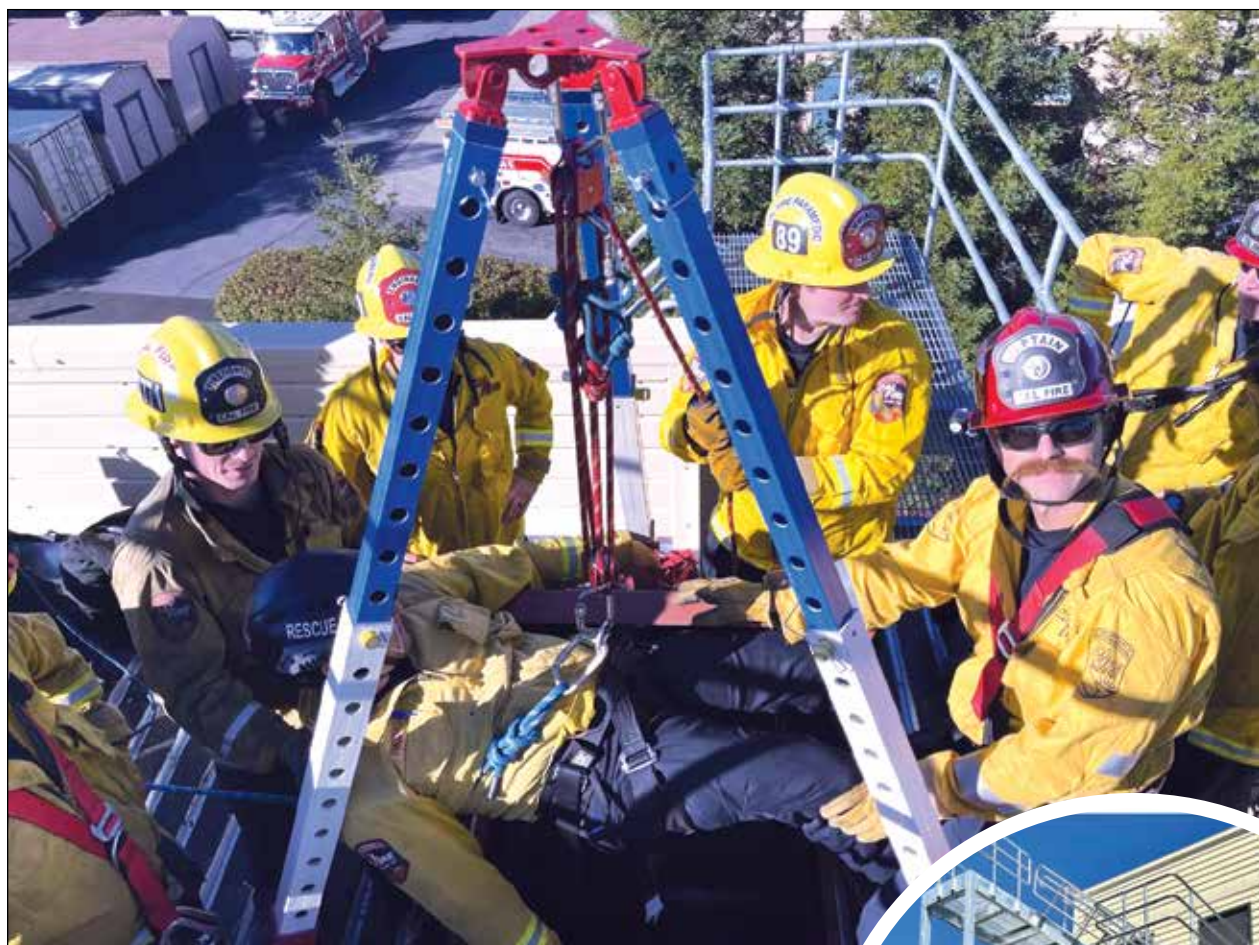
Above: Region Cal Fire teams train to lift a man in a rescue simulation. Right: The new Firefighter training structure at the Cameron Park (Calif.) Fire Department.

"The Firefighter tower can be used for wildland