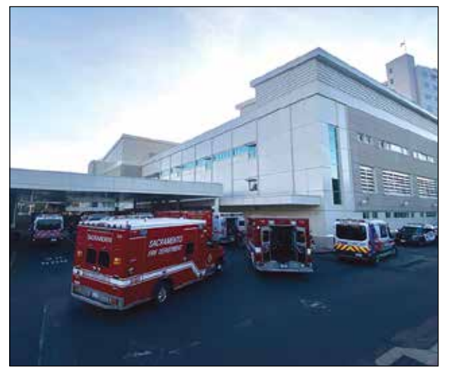
Urgent care clinics can handle most non-life threatening situations, allowing ambulances to focus on critical situations.