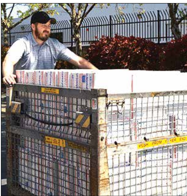
Check out some photos below of this huge shipment that took all day to complete!

While it's nice to reclaim a little bit of office space, we're not slowing