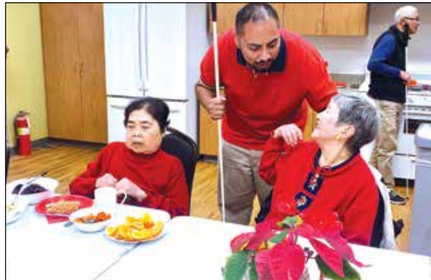
Students in Society for the Blind's Senior IMPACT Project enjoy a meal after learning to cook in the group's new teaching kitchen, one of the skills funded by a grant from M&M Whitmire Family Foundation.

The Senior IMPACT Project includes an eight-day retreat offered monthly at Society for the Blind that gives seniors an immersion experience where they learn alternative techniques and skills to travel safely, efficiently and independently. They practice alternative techniques and use adapted tools to perform tasks of daily living including cooking, cleaning, shopping, home maintenance, organization, personal finance and more. They learn how to use