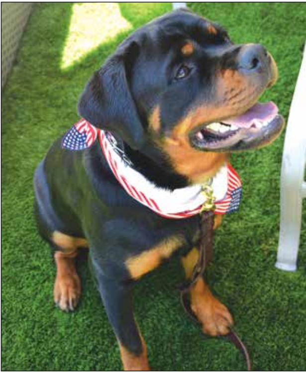
Isabella was acquired from "Top Line Rottweilers" in Carmichael.