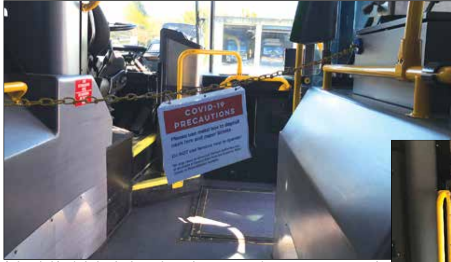
A detachable chain barrier is used to reduce exposure between passengers and drivers.

social distancing when riding bus and light rail vehicles by staying at least six feet away from other riders and operators when possible. To protect operators, SacRT is currently installing a protective plexi-glass barrier on each bus by the driver's seat and adding a detachable chain barrier above the white line