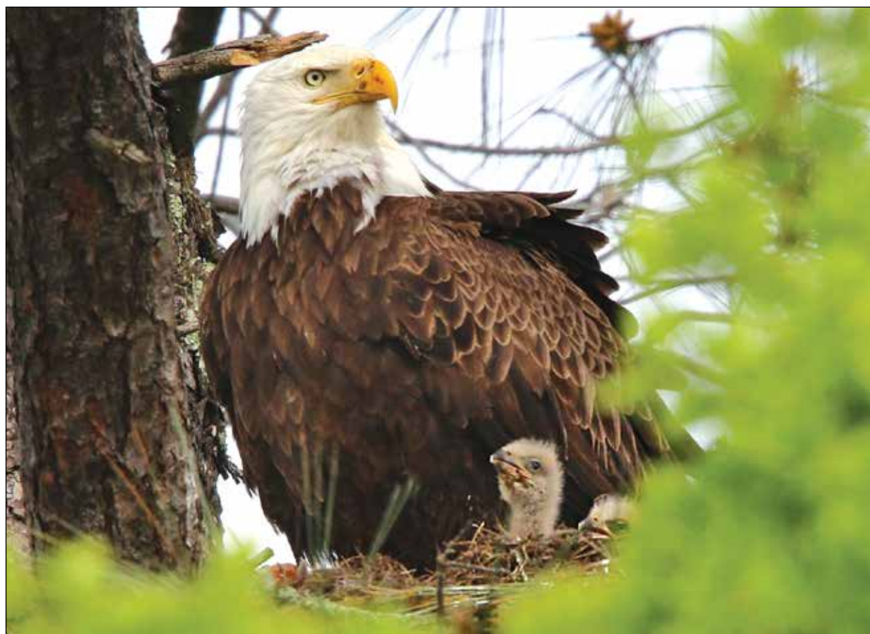
Courageous and hopeful. At about one week old, the seventh and eighth bald eaglet babies hatched to their American River parents peer from their canyon eyrie. Proud papa shelters the babies from a spring shower.

Story and photo by Susan Maxwell Skinner