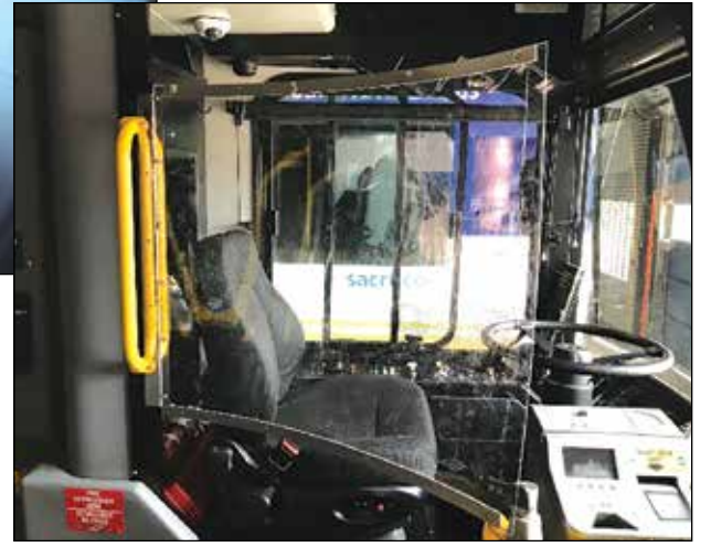
SacRT is currently installing a protective plexi-glass barrier on each bus by the driver's seat.

We encourage customers and the public to stay informed of SacRT updates by checking our COVID-19 page at sacrt.com/covid19 ★