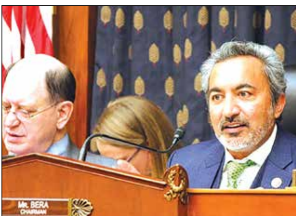
Congressman Ami Bera, M.D. (D-CA) chaired congressional hearings on the coronavirus outbreak for the House Foreign Affairs Subcommittee on Asia, the Pacific, and Nonproliferation.

"I'm proud to vote for this robust emergency funding package that will keep our communities safe from this growing public health crisis," said Rep. Bera, who chairs the House Foreign Affairs Subcommittee on Asia, the Pacific, and Nonproliferation. "As a public health expert, I will continue to press the administration to ensure they are doing everything