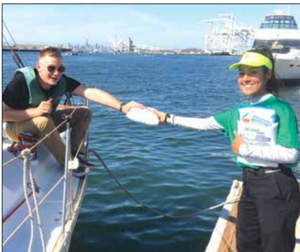
California has one of the highest levels of recreational boating activity in the nation; Train to keep it clean!

Anyone who is interested in this effective educational program can view our online Dockwalker videos to learn what we do and see our success stories. Individuals