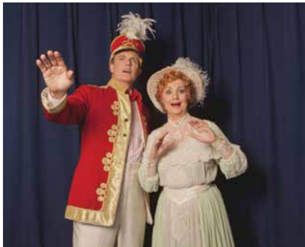
Broadway Sacramento had its own trouble when "The Music Man" came to town in 2012.

to play a certain Meredith Willson Broadway tune.)