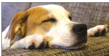
Pets for Vets Act – a win for both veterans seeking companion animals and shelter pets in need of a home.