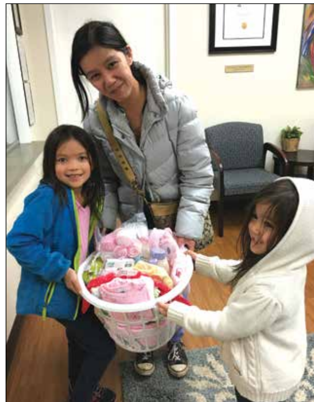
A patient and her children receive a baby basket from Sacramento Life Center, thanks to the group's Baby Basket Drive held each December.

"One of the most overwhelming feelings is learning that you're pregnant and fearing you won't have the resources to care for your