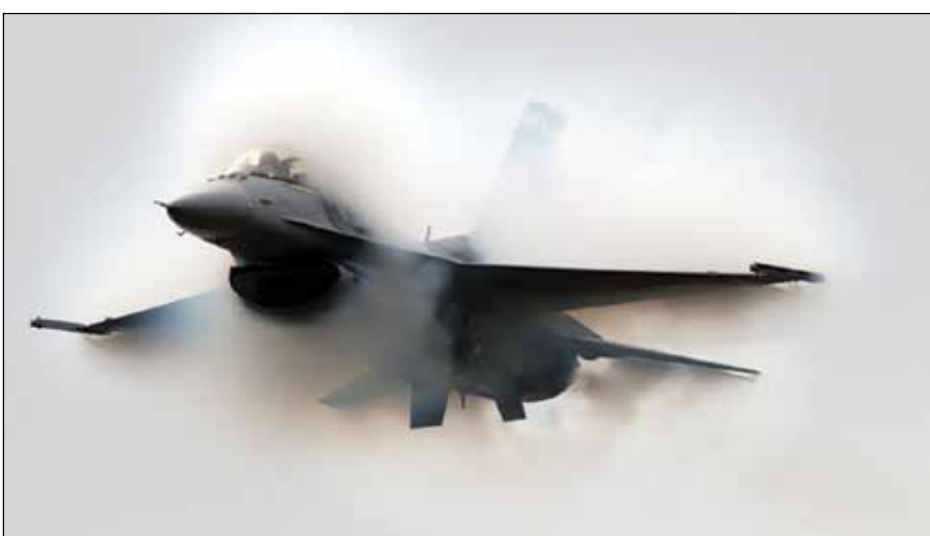
Returning to Mather Airport for its 14th year, the airshow offers miles of static display aircraft in all shapes and sizes as well as interactive STEM experiences for the enjoyment of kids and families.

SACRAMENTO REGION, CA (MPG) - The California Capital Airshow (CCA), presented by Sacramento County in partnership with the City of Rancho Cordova, announced the exciting performer lineup and kickoff of ticket sales for the October 5 and 6 airshow. Headlined by the world-famous U.S. Navy Blue Angels, this year's show is packed with hours of entertainment in the air and on the ground. Family-friendly ticket pricing provides admission for up to six youth ages 6-15 with the purchase of just one Adult General Admission ticket.