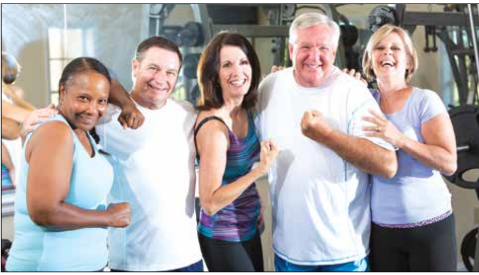
The program is made up of 2-person teams assigned to completing a set of team challenges.