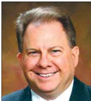
By David Dickstein, Gold River resident

'First the bad news: Hallmark Gold Crown store in Gold River has only a few more days to live. Now the good news: I know where you can buy it a condolence card cheap.