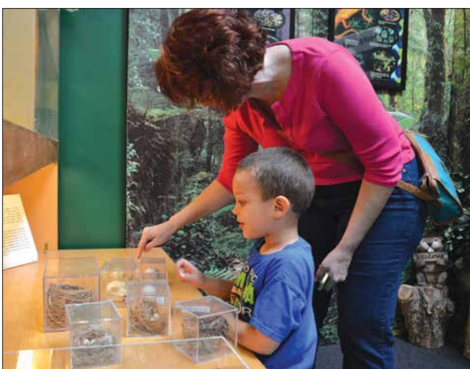
New This Year, Free Museum Day is Kick-Off to a Week Filled with Special Events, Activities & Activations Happening at Various Local Museums.

New in 2019, Free Museum Day is the kick-off