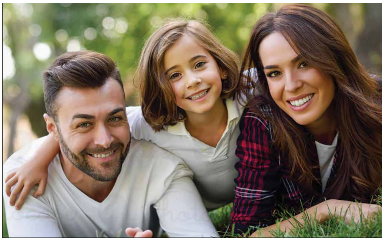
Counties throughout California are working to recruit loving families to care for foster children.