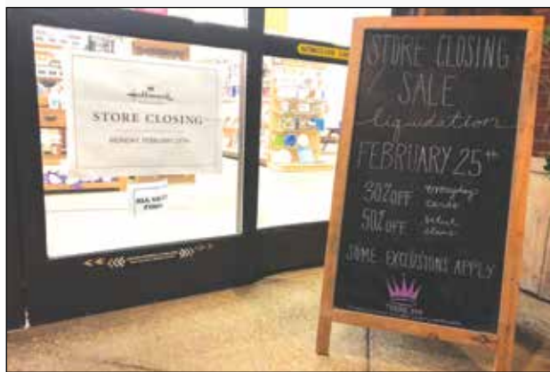
Gold River's Hallmark Gold Crown store closes for good this month.

respectively. Let's hope that the last-remaining employees have something else lined up already, or will soon find a new job. Heck, maybe they can stay where they are by working at whatever moves in.