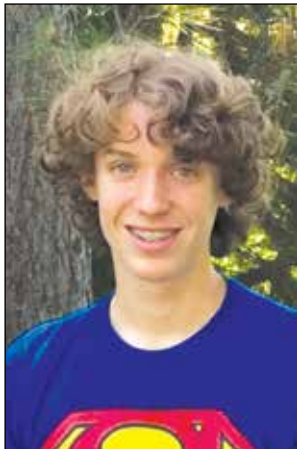
Bethesda and Electronic Arts/DICE have underestimated how quality-discerning their fanbase is, and even if Battlefield V and Fallout 76 earned enough from pre-release orders to cover their costs the stain on both companies' reputations could prevent that from happening again down the road.

The answer to why these clearly incomplete products were released at all probably lies with the holiday season; November and December are the biggest months for video game purchases, and considering the lack of successful new products from either Electronic Arts/DICE or Bethesda this year, they likely wanted to take advantage of an injection of revenue rather than wait another year. This strategy operates under the assumption, however, that any product they release will sell a viable number of units to cover the high cost of making a game. With Battlefield V , and especially with Fallout 76 , this is unlikely to be