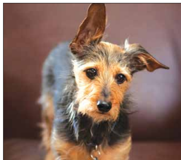
Charlie is a snuggle bug and loves to position himself right up against family members on the couch and in bed.

Charlie is a mixed breed ½ yorkie and ½ dachshund. He is sometime called a "dorkie". He was actually an accident as his 4lb yorkie mom wasn't supposed to "connect" with his 9 lb. dachshund, Dad, so he was given to his current owners, free of charge.