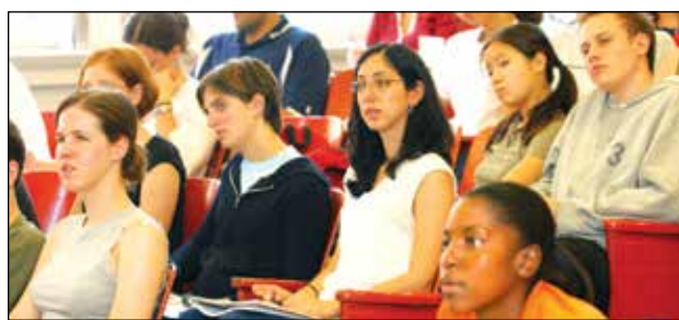
Students pay more at community colleges despite lower published tuition - called the "sticker price" - because tuition and fees only tell part of the story when it comes to college costs.