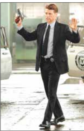
Usually, flash-forwards are cop-outs, but the final season's opening shot of our heroes—and villains! (Ben McKenzie, pictured).

for being so weird! Fox's new oddity wants judges Jenny McCarthy, Robin Thicke, Nicole Scherzinger and Ken Jeong to guess the