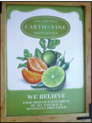
This small, family owned company located in Lincoln, California is dedicated to providing very high quality jams, sauces, and marinades to make wonderful easy recipes because all the work is done in the bottle.

LINCOLN, CA (MPG) - Imagine preparing and savoring a dinner of grilled Pineapple Sake Teriyaki Salmon, Apricot Pineapple Tangerine Wild Rice with cranberries and for dessert Caramel Apple Parfait using a Caribbean Banana Caramel Finishing Sauce. Before dinner, let's have a Key Lime Jalapeno Margarita served with the classic cream cheese spread with Red Bell Pepper Ancho Chili Jam. This menu is served up by Earth & Vine Provisions, a company that believes that "Food should taste great, be all natural and minimally processed." This small, family owned company located in Lincoln, California is dedicated to providing very high quality jams, sauces, and marinades to make wonderful easy recipes because all the work is done in the bottle.