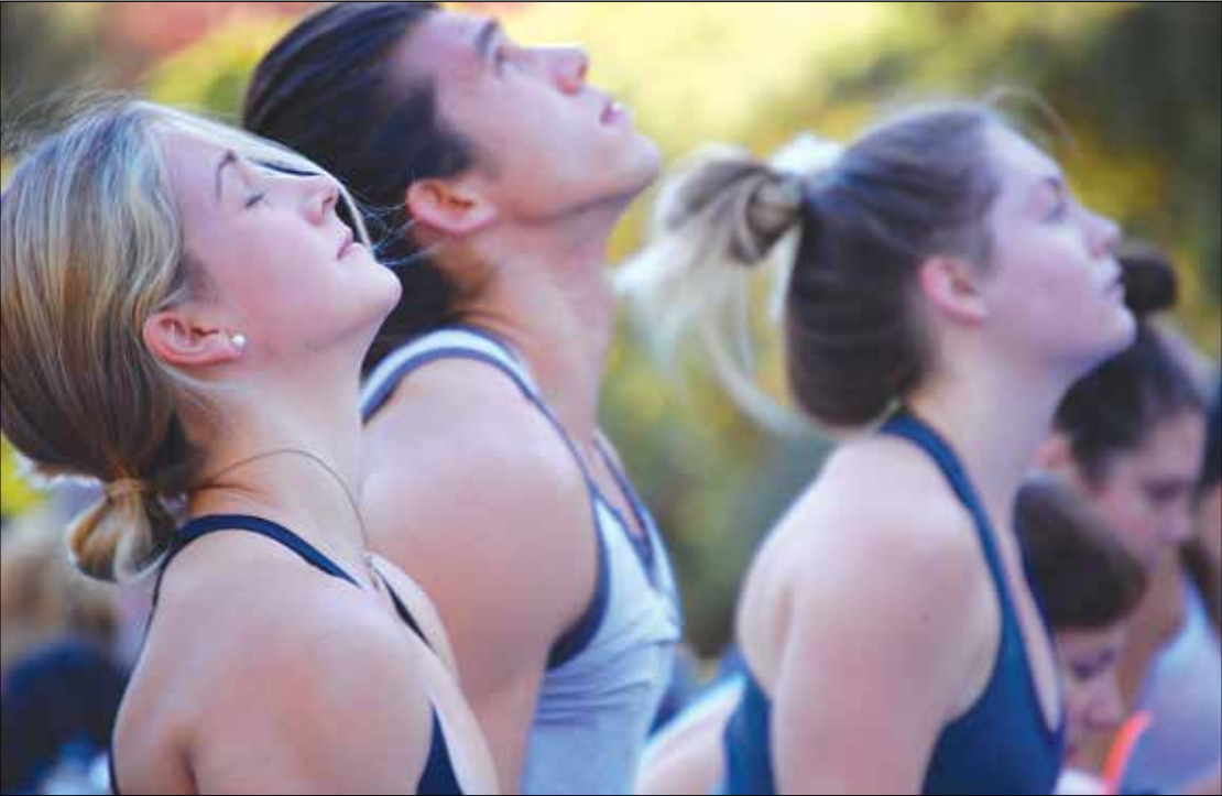
Beginning April 2nd, 2016, Folsom and Davis parks will add weekly free classes.

WEST SACRAMENTO, CA (MPG) - The Sacramento region will soon have five parks participating in free weekly community yoga classes. Local nonprofit, Yoga Moves Us, holds regular free yoga classes at three of the Sacramento area’s largest parks: McKinley Park, Tahoe Park, and Maidu Park in Roseville. Beginning April 2nd, 2016, Folsom and Davis parks will add weekly free classes.