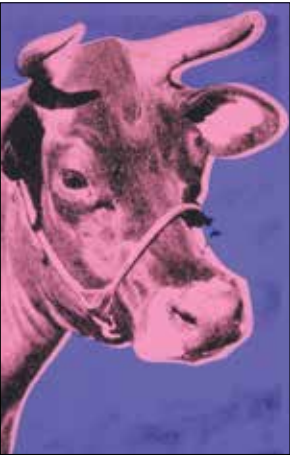
At left: Andy Warhol, Cow, 1976. Screen print on wallpaper. 45 1/8 X 29 1/2 in. The Andy Warhol Museum, Pittsburgh, PA1994.7. © 2015 The Andy Warhol Foundation for the Visual Arts, Inc. / Artists Rights Society (ARS), New York

a comprehensive collection of international ceramics, as well as European, Asian, African, and Oceanic art. The