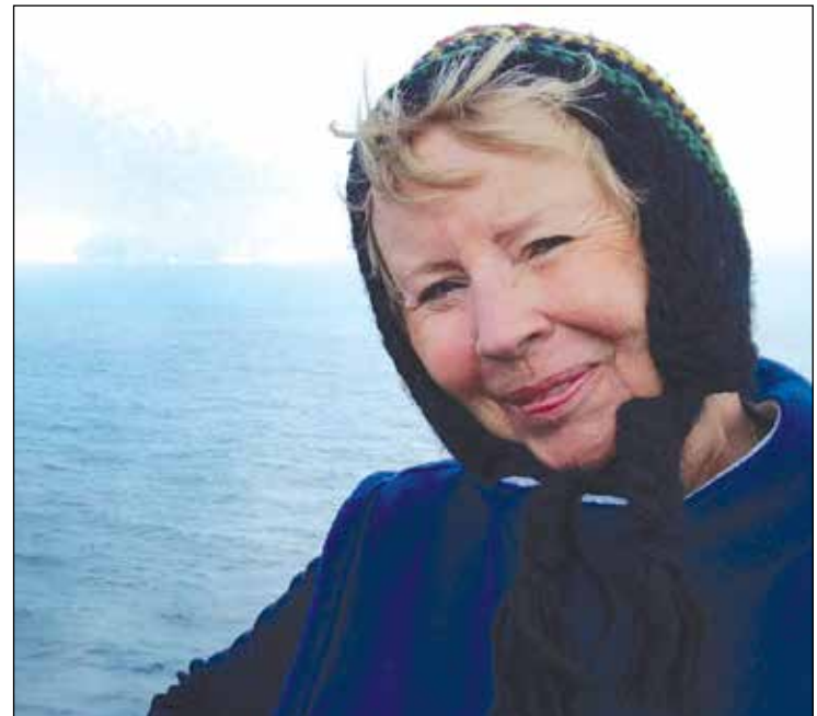
Though the days of GIs shipping off into the Pacific are long gone, the view of San Francisco and the memories remain. Today, many come from far and near to have a good time, not wondering if the fate of war will allow them to return.