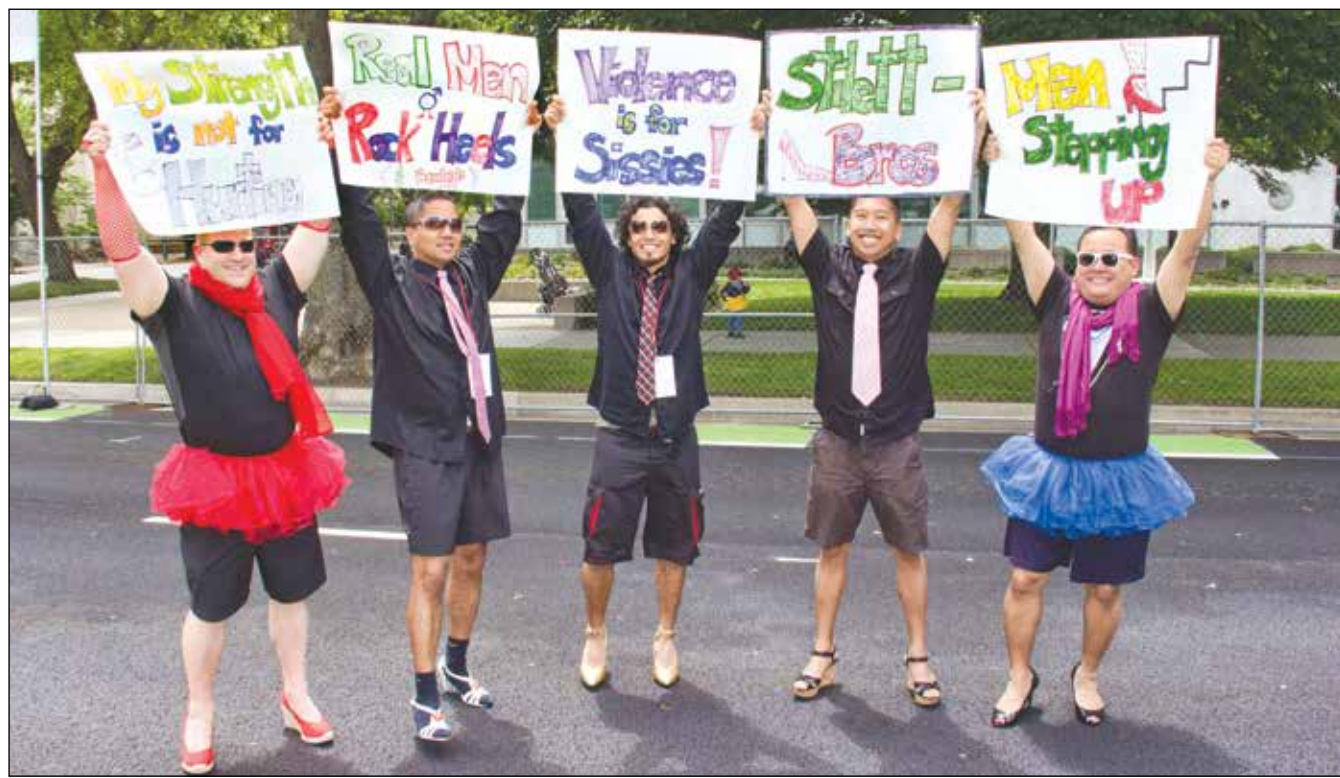
Domestic violence is the third leading cause of homelessness among families in the United States. If you're a man who wants to take advantage of an impactful way to ensure women in your community are protected from a life of fear and violence at the hands of their partners, don a stylish pair of heels and "Walk a Mile in Her Shoes!"

We don't have to be victims of domestic violence and intimidation, sexual assault, stalking, or human trafficking to feel the effects of it all. There's a financial element to this growing crime segment. Nationally, women lose eight million days of paid work every year because of the abuse perpetrated against them by current or former male partners. This loss is equivalent to over 32,000 full time jobs.