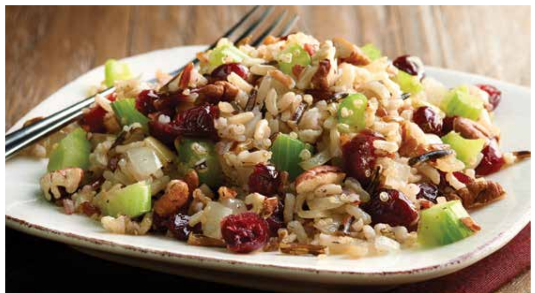
Cranberry Pecan Multi-Grain Stuffing