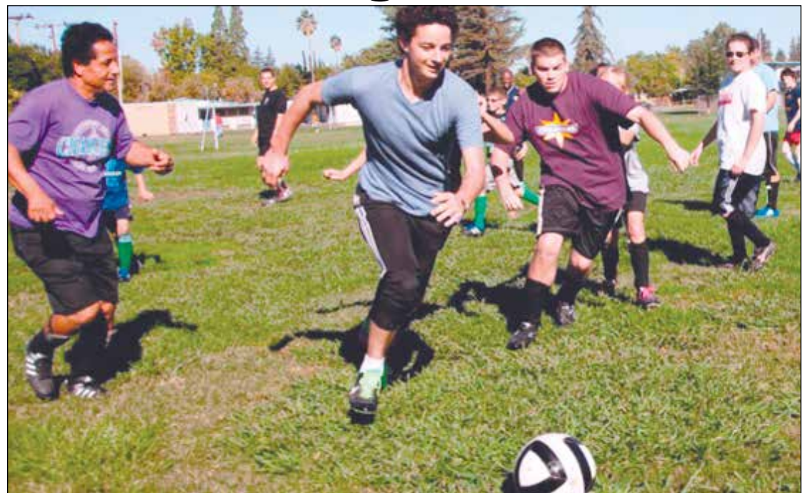
TRS volunteer attempts goal during the Chargers' last soccer practice before Special Olympics competition.