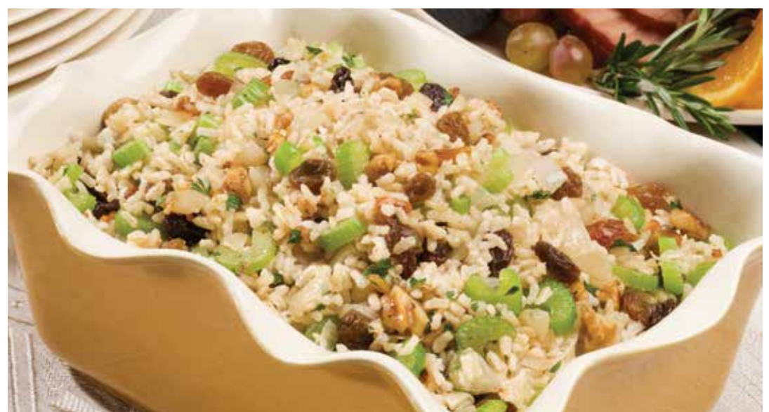
Honey Nut Dressing