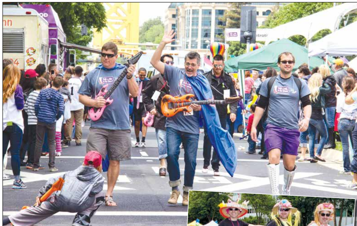
WEAVE's 2015 fundraising event, scheduled for Sunday, May 3rd, 2015, is slated to top last year's efforts; their goal is to have 1,000 men participate. This will not only bring additional money to the group, but it will break a world record. The organization is accepting registration forms now.

One Thousand Men Sought for 2015 Record-Breaking March