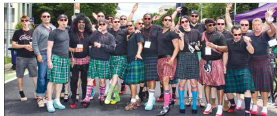
620 men marched in women's high heels last spring to raise awareness of domestic violence and sexual assault at WEAVE's 2014 Walk a Mile in Her Shoes event. Through sponsorships, they raised over $237,000 to fund many programs the organization provides to victims of abuse.

hundreds of women in Sacramento County who have experienced violence. The program grew from the need to assist victims of violence in attaining economic independence. Lack of financial freedom is a common factor that binds abused women to their abusers. Many of WEAVE's cli-