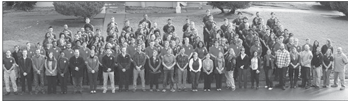
After completing 10 months of intensive service to disaster survivors, 110 FEMA Corps members were honored at a graduation ceremony on December 5th. The graduates responded to the Oso Mudslide and the Napa Earthquake, assisted disaster survivors at their greatest time of need, helped pioneer new methods of disaster preparedness, and developed leadership and problem-solving skills to last a lifetime.