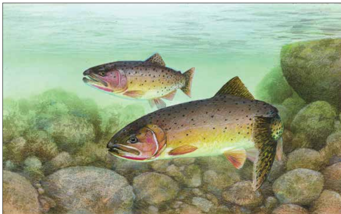
Colder winter temperatures and recent rain are allowing hatchery staff to begin filling the raceways with cooler river water and start producing rainbow trout for planting in northern California lakes in the summer of 2015.

GOLD RIVER, CA (MPG) - The American River Trout Hatchery operated by the California Department of Fish and Wildlife (CDFW) recently reopened after warm water temperatures forced the closure of the facility in early summer.