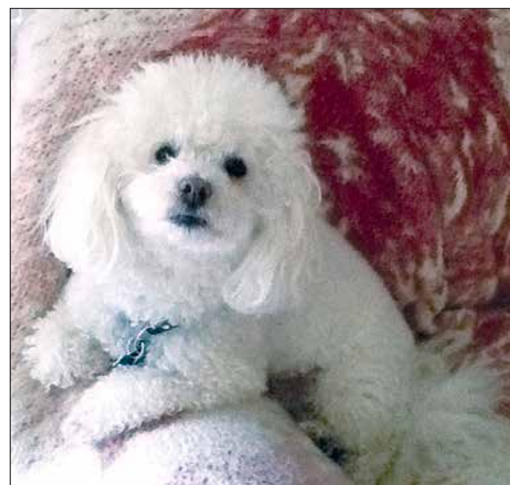
Puppy or adult, the Bolognese will steal your heart.