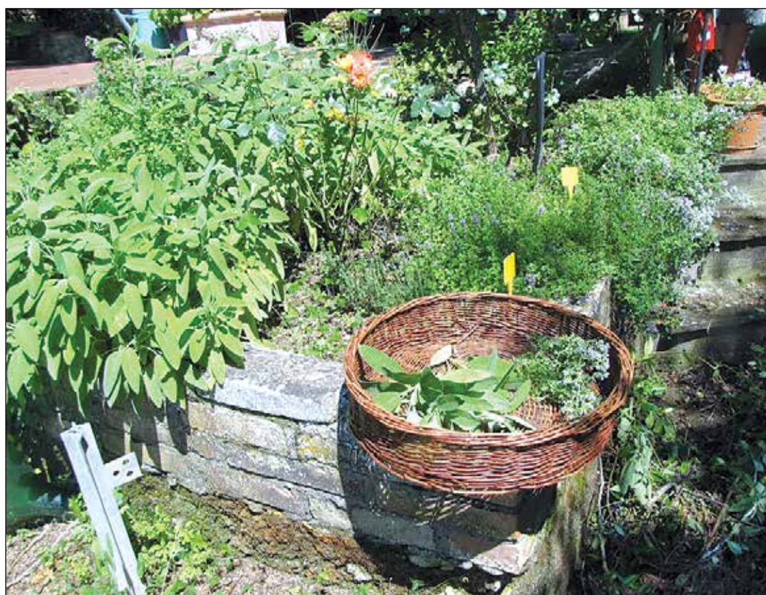
Fresh Tuscan garden herbs from the Poggio Etrusco in Montepulciano, a private organic farm.

Sangiovese grapes and olive trees. Pamela is an acclaimed chef and food writer. Her 13 books include a wonderful variety with the newest Cucina Povera, Tuscan Peasant Cooking. It was my lucky day to enroll in her Farmers Market class.