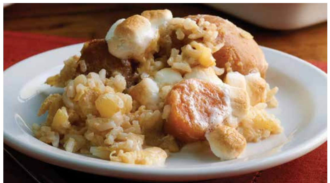
Sweet Potato Rice Casserole

Remove from heat, and let stand 5 minutes. Stir in pecans and season with salt and pepper, if desired.