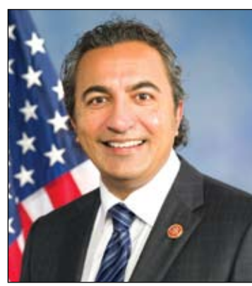
Congressman Ami Bera

Congressman Ami Bera, M.D. represents Sacramento County. For more updates on Rep. Bera visit http://www.bera.house.gov ★