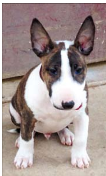
Hank is an AKC registered pure breed English Bull Terrier.