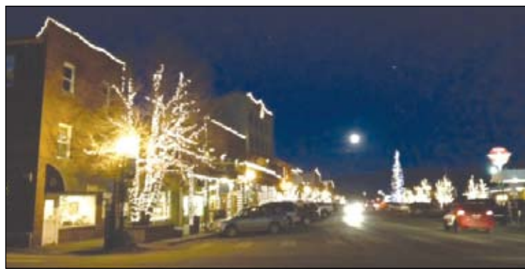
Truckee is also a conveniently short drive from four ski resorts, or you can take advantage of the free ski shuttle that departs Truckee's train station every hour for Squaw Valley, Northstar, Alpine Meadows, or Homewood ski resorts.

Truckee is surrounded by the dramatic Sierra Nevada Mountains and is only 13 miles from Lake Tahoe. The 72-mile drive around magnificent Lake Tahoe, the largest alpine lake in North America is a must see. Its extraordinary blue water is set like a jewel in the mountains.