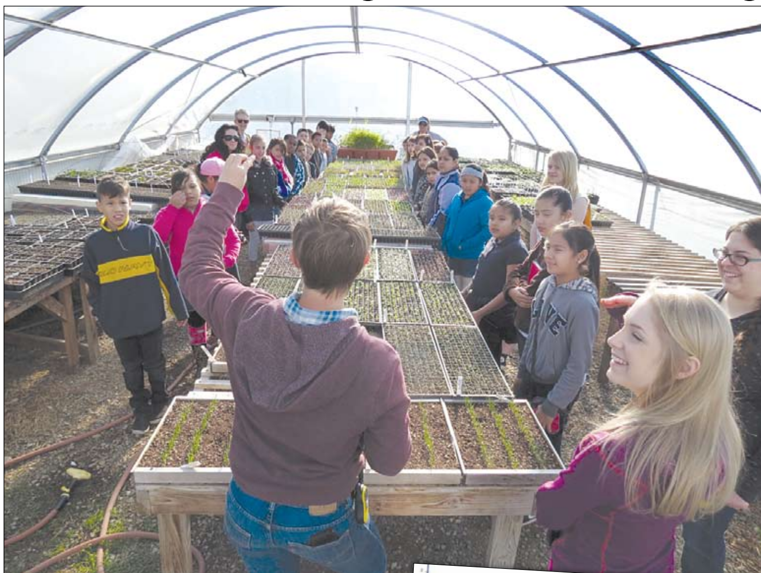
Soil Born Farms is about so much: growing food, mentoring youth and future farmers, teaching people how to cook and garden, creating urban farms and preserving wild spaces. Developing partnerships and improving access to fresh produce throughout our community, and at the core, it is about making a difference.