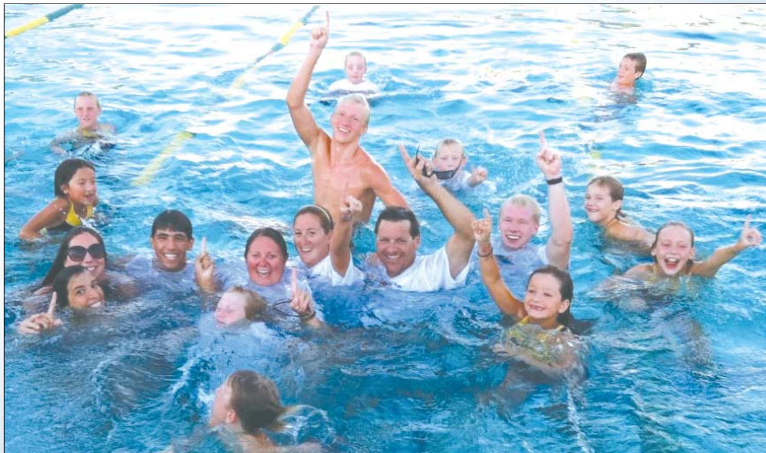
Gold River Champs in the water!