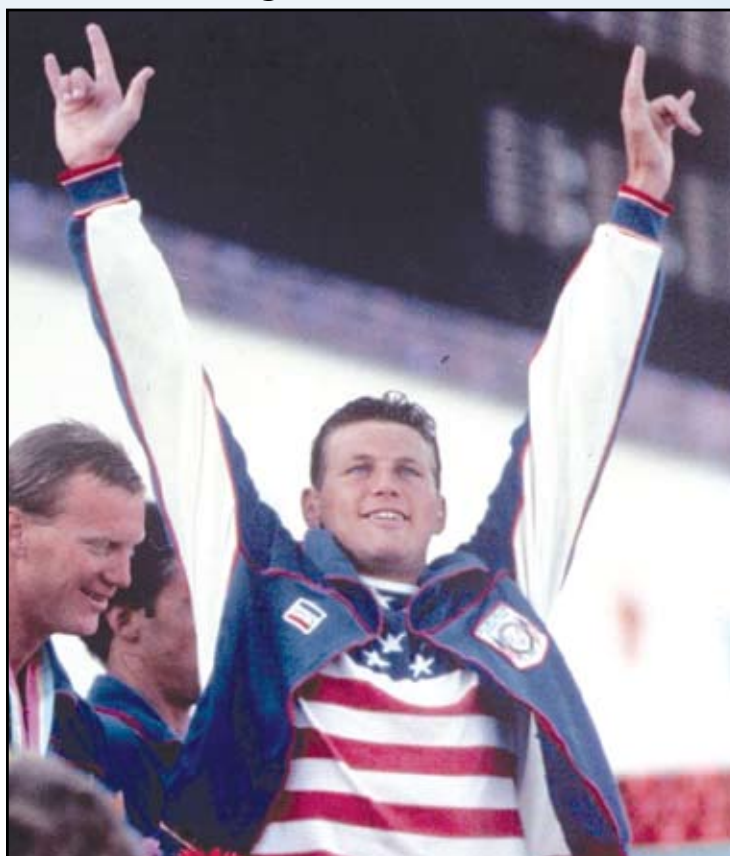
★ Standing on the podium at the 1984 Summer Olympics.