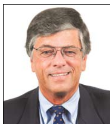
JACK RYAN: SHADOW RECRUIT (Rated PG-13) A Film Review by Tim Riley

BJ invites the community to stop by for a sample of the variety of foods offered in the food court. ★