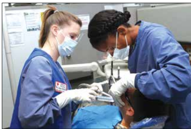
The CDA Foundation provides grants and scholarships to dental students and professionals, promotes oral health prevention and education,

Parking for the event is free and no identification