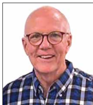
Commentary by Lou Binninger

While Sutter County Supervisors increased their monthly auto allowance to $400, Yuba Water Agency directors debated raising their pay by 5% versus 3%, and Marysville City Council is leaning to treat themselves to cell phones, thousands of local small businesses have been illegally forced to close and hundreds will never re-open.