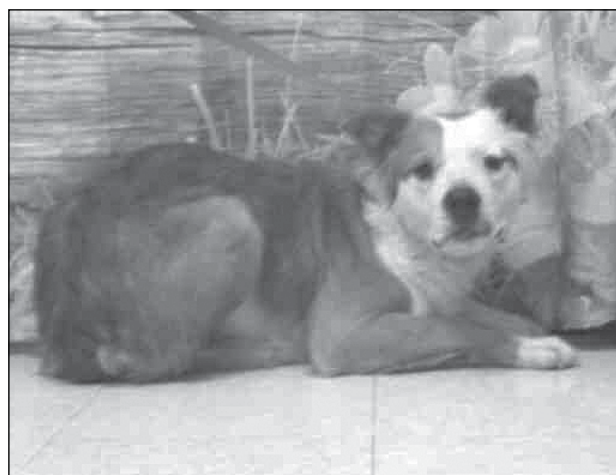
Baxter is seeking a permanent home.

Yuba County Animal Care Services is located at 5245 Feather River Blvd., Olivehurst. The phone number is 530-741-6478. You can also go to www.petharbor.com or www.petfinder.com to see all of our adoptable animals and look for your