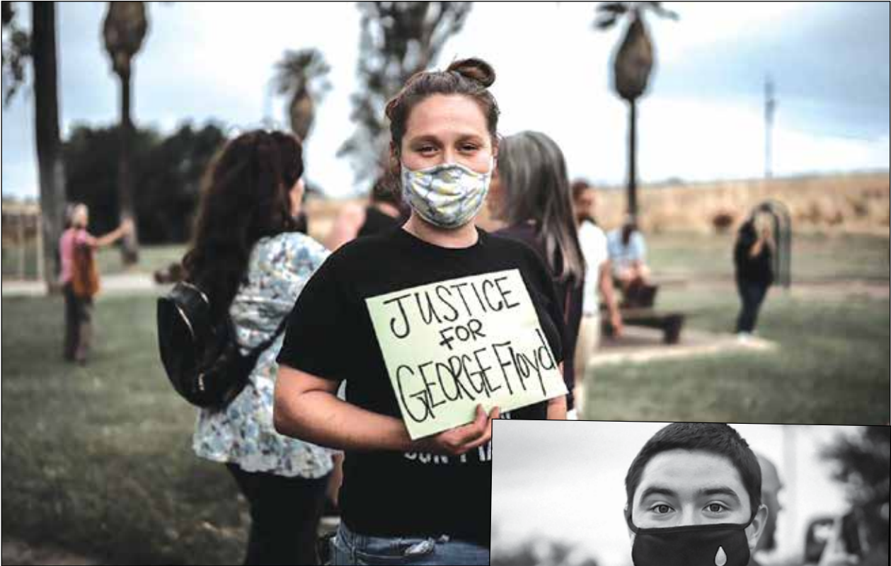
Demonstrators brought awareness to the cause seeking “Justice for George Floyd” to the Ellis Lake Gazebo, in Marysville.