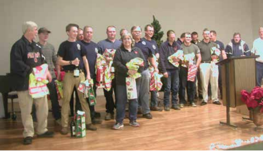
The annual recognition of the volunteer fire fighters of the Dobbins Oregon House Fire Dept