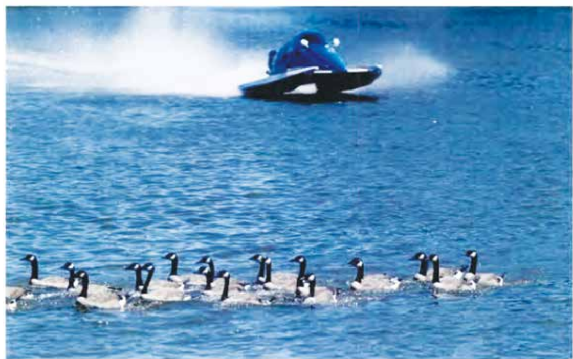
2010 Appeal Democrat picture when Ellis Lake was supplied with river water

lizing Yuba River water while offering inaccurate or exaggerated assumptions according to Mathews. For example, EKI claims the Yuba Water approach would result in high capital investment, operating and permitting costs.