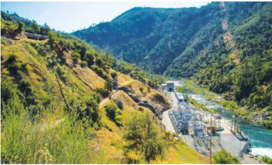
Image of New Colgate Powerhouse on the Yuba River, owned and operated by Yuba Water Agency