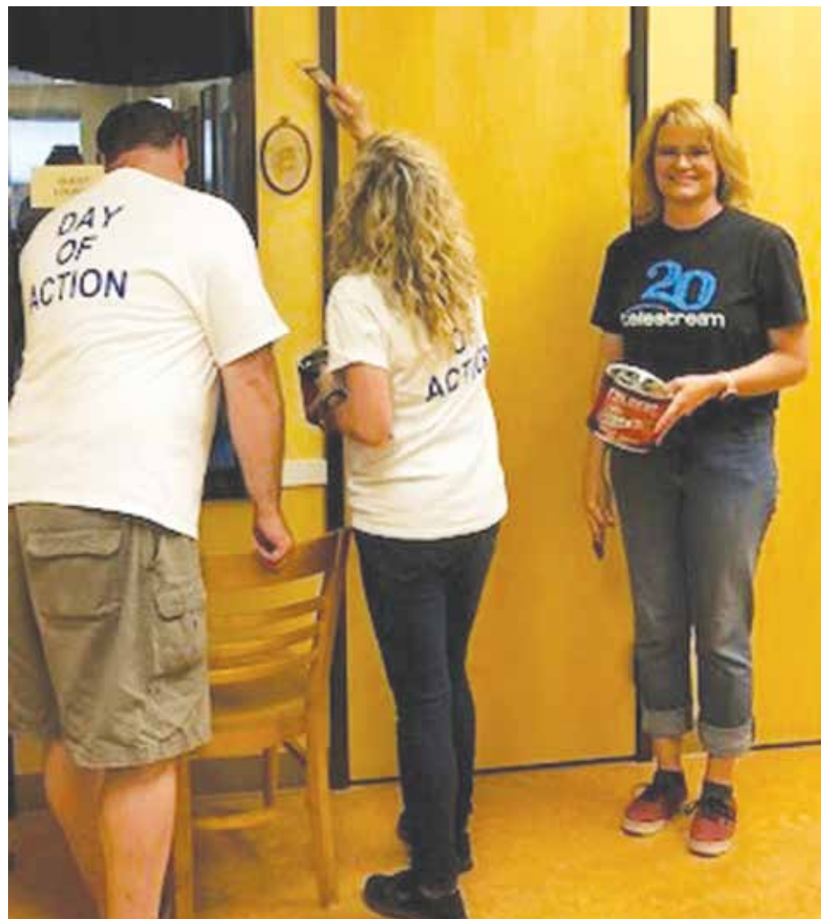
Telestream employees helping out during last year's Day of Action.

Adults and 3.00 Children, suggested donation