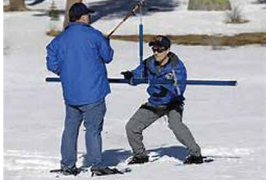
File picture weighing water content

(excerpts from Michael MCGough Sact. Bee)