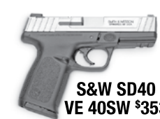
S&W SD40 VE 40SW $353

One of the features that sets us apart is our quick-release take down pin, which acts as a button to separate the upper from the lower just enough to disengage semi-automatic operation and automatically disable the magazine lock. Once your upper is separated and disengaged from semi-automatic operation, your magazine release is now operable. A simple tap closes the upper and re-engages the spring loaded take down pin and will quickly get you back in the fight. The hellfighter mod kit is compatible with any AR-15 or AR-10. This is the same kit that is factory installed by Windham Weaponry (AR-15 superlite), POF (AR-15 constable. ATA (A-15 Omni) all sold in California and are California compliant. You can purchase from us at $69.99 and install yourself or have us install for a fee of $25.00.