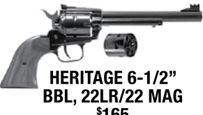
HERITAGE 6-1/2" BBL, 22LR/22 MAG $165