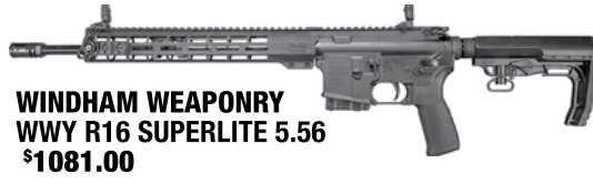
WINDHAM WEAPONRY WWY R16 SUPERLITE 5.56 $1081.00

ROTHCO EARMUFFS .... $18 REMINGTON TRIGGER LOCKS .... $7 REMINGTON CABLE LOCKS .... $8 AR-15 MAGAZINES, 10 & 5 ROUND .... $21 S&W M&P SHIELD 9MM MAGAZINES .... $25 S&W M&P SHIELD 40 CAL. MAGAZINES .... $25 WALTHER P22Q MAGAZINE .... $28 S&W SDVE 9MM MAGAZINE .... $27 SAVAGE 22LR FOR 62, 64 & 954 MAGAZINE .... $15 BERSA FIRESTORM 380ACP MAGAZINE .... $18 RUGER AMERICAN PISTOL 9MM MAGAZINE .... $28 MOSSBERGPLINKSTER&FLEX22-22LRMAGAZINE....$20 CRIMSON TRACE CMR-208 TACTICAL LIGHT .... $78 NIGHT STICK TACTICAL LIGHT .... $113