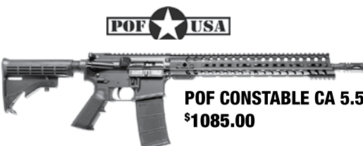
POF CONSTABLE CA 5.56 $1085.00

ALSO IN STOCK RIFLES, SHOTGUNS AND LOTS OF AMMUNITION.