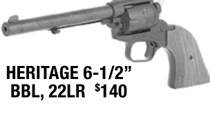
HERITAGE 6-1/2" BBL, 22LR $140