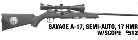
SAVAGE A-17, SEMI-AUTO, 17 HMR W/SCOPE $512