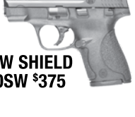
S&W SHIELD 40SW $375