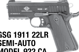
GSG 1911 22LR SEMI-AUTO MODEL 922 CA 3" BBL $351