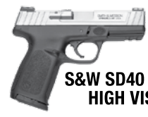
S&W SD40 VE 40SW HIGH VIS $370