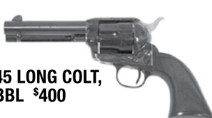
CIMMERON 45 LONG COLT, 4-3/4" BBL $400