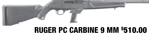
RUGER PC CARBINE 9 MM $510.00