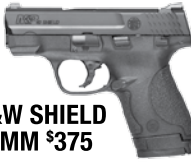
S&W SHIELD 9MM $375