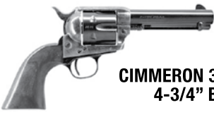
CIMMERON 357 MAGNUM, 4-3/4" BBL $400