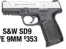
S&W SD9 VE 9MM $353