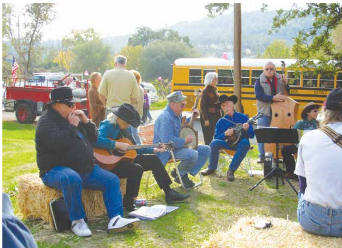
Partying with Huell Howser 10 years ago