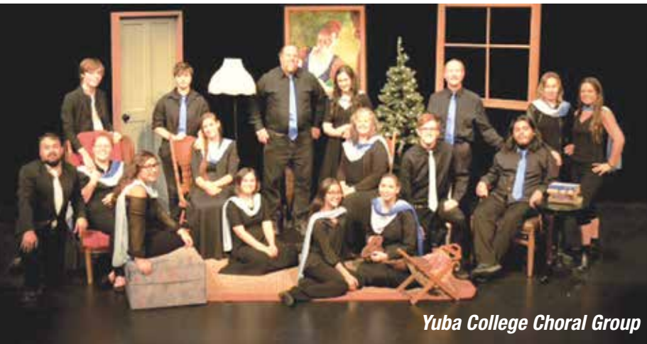
Yuba College Choral Group

Women in the Yuba-Sutter area are invited to attend the Holiday Brunch at Peach Tree Country Club on Saturday, December 9 at 9:30 a.m. This year the event is organized by Bridges to Housing, Marysville Art Club, Soroptimist of Marysville-Yuba City, Delta Kappa Gamma Iota Sigma Chapter, and the Marysville-Yuba City Branch of the American Association of University Women.