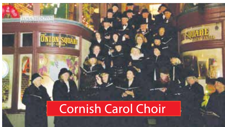
Cornish Carol Choir

For more information on Cornish Christmas: 530.272-8315 or visit www.downtown-grassvalley.com