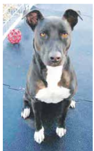
ready to go home today; she is up-to-date on her

This week Yuba County Animal Care Services would like you to meet our featured pet "Tiki" (A166116), a two year old Lab mix. This is a beautiful dog with a wonderful personality. Tiki is very quiet, loves to go on walks, and loves children. Tiki was brought to us because her former family wasn't able to give her the time and attention she needs. Tiki is a sweet gentle girl who needs a home to call her own, could that home be yours! This girl is