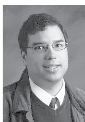
Yuba City, Ca.

Guest Speaker at Sutter Buttes Tea Party