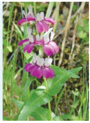
plants along the trail.

highly regarded for the many species that bloom on its hills and slopes. Each season observers are delighted with an ever-changing tableau of spring color. Early season walkers will find Western Buttercups, Zigzag Larkspur, and Shooting Stars. By mid-season, the hills turn gold and purple with Tufted Poppies and a variety of lupine. Mid to late season floral treats include Fairy Lanterns, Chinese Houses, and Birds-eye Gilia. Docents will share facts, legends and the many uses of the flowers and