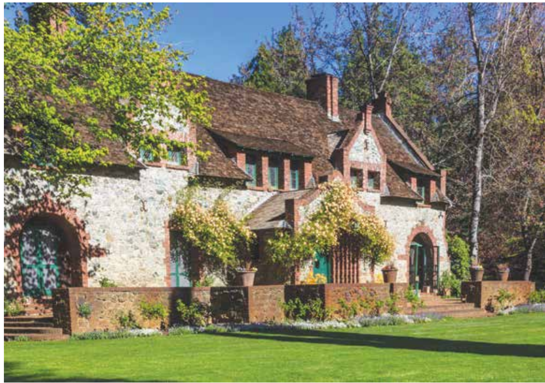
Empire Cottage is a stately tribute to California’s influential Bourn Family – as well as our gold-mine history.