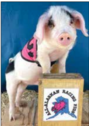
Watch the All-Alaskan Racing Pigs jump obstacles and race to the checkered flag at this year's Sacramento County Fair.