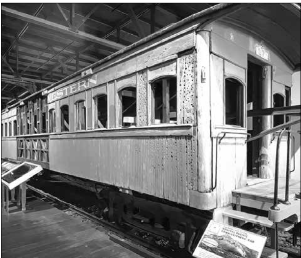
The historic Central Pacific Commissioners’ Car that traveled to Promontory, Utah – with former California Gov. Leland Stanford for the completion of the Transcontinental Railroad in 1869.

SACRAMENTO, CA (MPG) - Three Sacramento area museums are collaborating to present “A Stanford Spring,” a limited-time offering that showcases the lives of Jane and Leland Stanford with unique artifacts on display at the California State Railroad Museum, Leland Stanford Mansion State Historic Park and the Sacramento History Museum. The remarkable artifacts are on display now and will remain up through June at the three participating museums. Plus, special offers, promotions and events are planned to further highlight the experience and connect with museum visitors, including: California State Railroad Museum – On special display is an historic Central Pacific Commissioners’ Car that traveled to Promontory, Utah – with Central Pacific Railroad President and former California Gov. Leland Stanford and the priceless ceremonial Golden Spike on board – for the completion of the Transcontinental Railroad in 1869. Plus, a special “Travel in Style” excursion train ride is planned on May 27 at 4 p.m. (for guests ages 21 and over) that will include light appetizers, wine, and a souvenir wine glass to take home. Train ride guests will enjoy a scenic 45-minute ride down the Sacramento River in a first-class rail car (elegant attire is encouraged). Leland Stanford Mansion State Historic Park – A cherished cookbook owned by Jane Stanford titled Mrs. Hale’s New Cook Book published in 1857 is on special