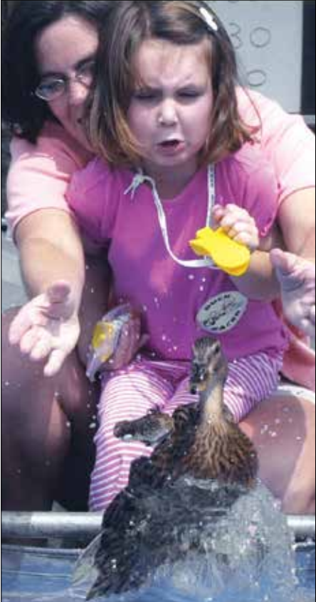
Kids launch the high-speed ducks towards the finish line at the All-American Duck Races.

Continued from page 1 price is right. All free with your Fair admission.” Mark your calendars for the 2023 Sacramento County Fair and come see the All-Alaskan Racing Pigs and All-American Duck Races. For more information about the fair and to purchase tickets, visit www.sacfair.com . Established in 1937, the Sacramento County Fair is dedicated to the safe and fun education of the greater Sacramento community and its youth in agriculture, business, and technology. A value-driven family event, Fair guests enjoy the friendly atmosphere, traditional county fair competitions, agricultural displays, hands-on activities, carnival, specialty food and festival-style entertainment. Close to 10,000 school children take advantage of free educational school tours and over 5,000 compete for awards in the livestock and competitive exhibit programs. The theme of 2023 Fair is: Where Tradition Meets Tomorrow. For more information, please visit www.sacfair.com . Share the Fair with #SacCoFair and follow us on Facebook: https://www.facebook.com/SacramentoCountyFair/ , and on Instagram: https://www.instagram.com/sacfair ★