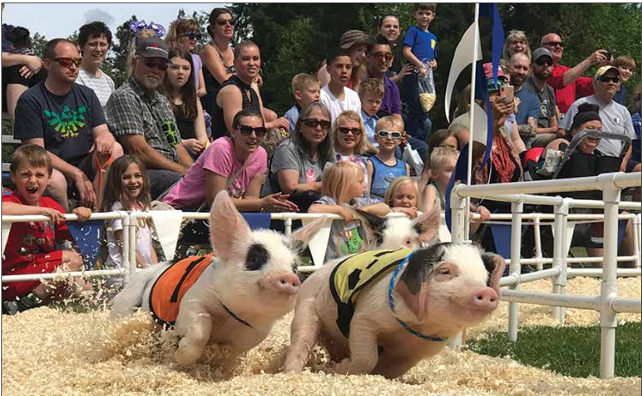
The All-Alaskan Racing Pigs competition is a popular, crowd-pleasing event suitable for all ages at this year's County Fair.