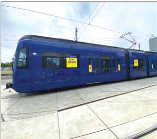
Image of new S700 low-floor light rail train at SacRT light rail facility.