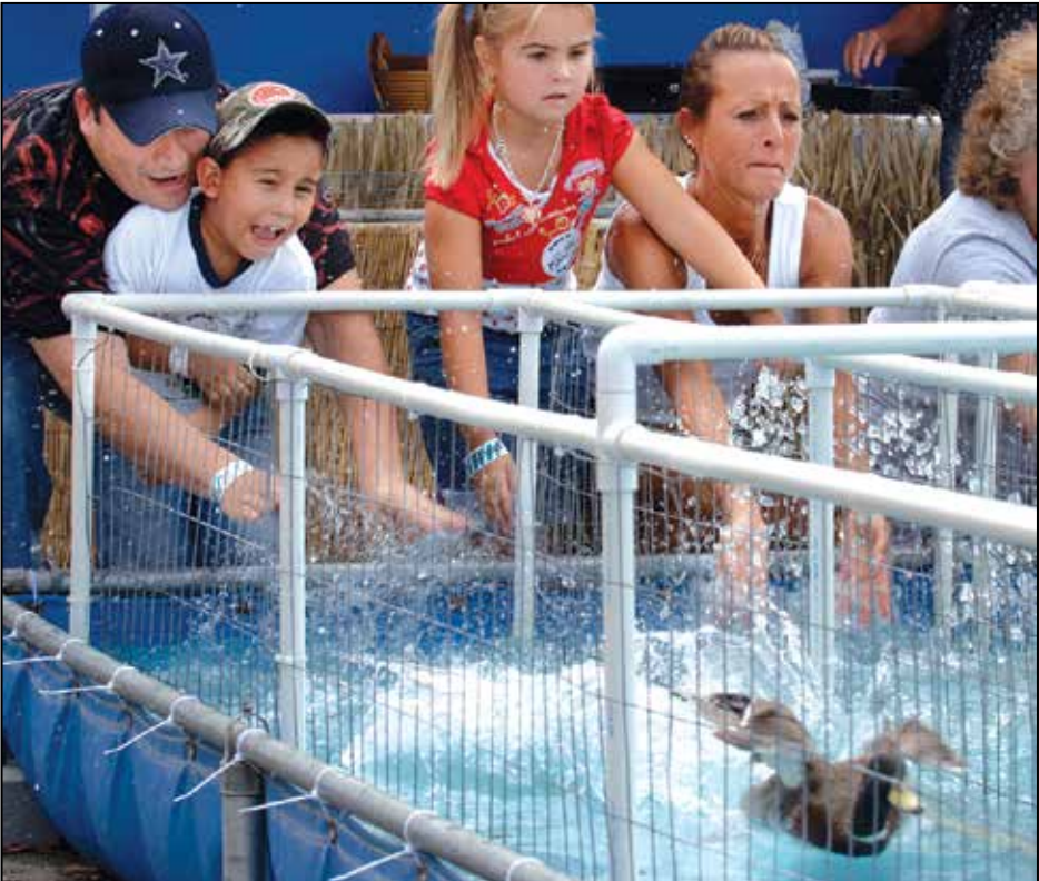
The All-American Duck Races show off the high-speed capabilities of the mallard at the 2023 Sacramento County Fair.