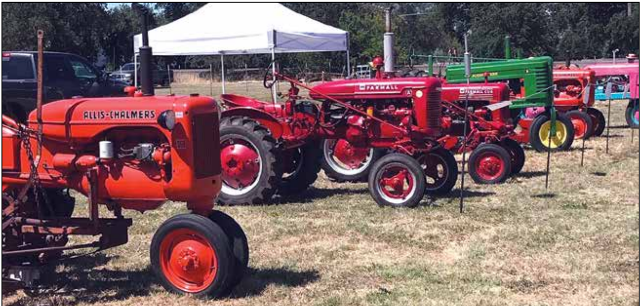
Vintage tractors on display at last year's event were among the many attractions to experience at the Annual Farm and Tractor Days.