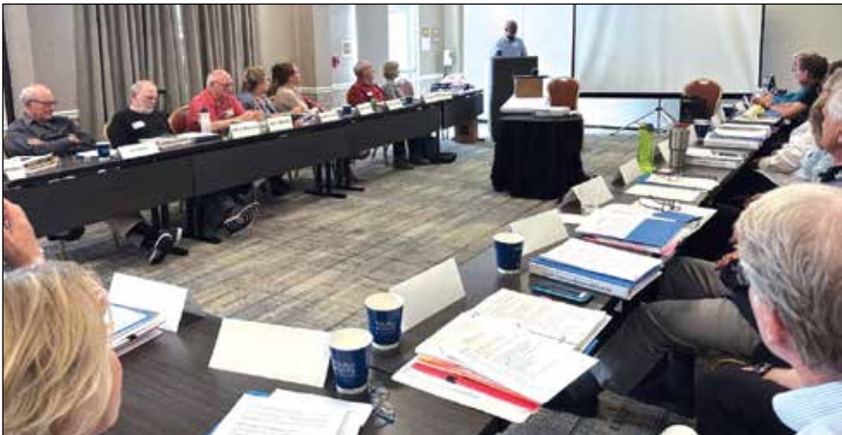
Beginning in late June the trainers will fan out across the State in teams of three or four and begin the challenging work of sharing their experience and knowledge.