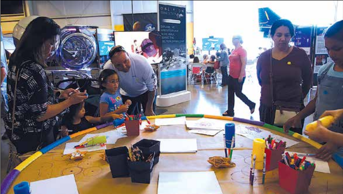
This Aerospace Museum craft center explores makani, the Hawaiian word for ‘wind’, to introduce kids to the concepts and uses available in wind power.