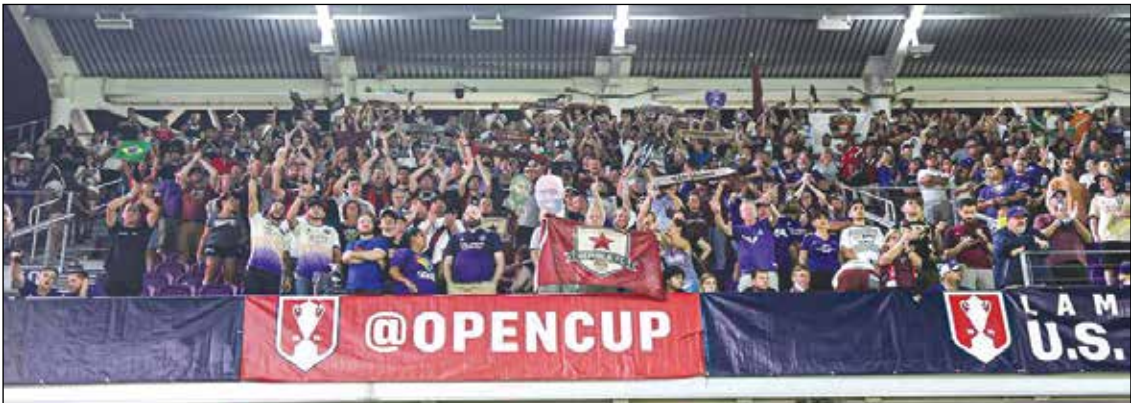
A large contingent of Sacramento Republic FC fans made the cross-country trip to support their side in its first Open Cup Final, and made their presence known throughout the night.