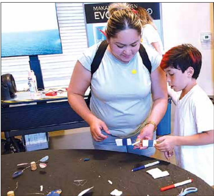
Kids are encouraged by their parents to apply their creativity to lessons pertaining to STEM curriculum.

Continued from page 1 STEM career herself and has been challenged and inspired by it. She wants the community to know that STEM activities at the museum are monthly and a strong focus of the facility. San Juan Unified School District partners with the Aerospace Museum. As a great illustration of support, girls were bussed from various junior high and high schools to attend the event. The busses were packed with girls representative of the cultural diversity in the Sacramento region. They visited the planes, used program passports to show their viewing of various displays and connected with career mentors. On the lighter side, snacks were enjoyed, pictures with friends were taken, a few stepped into cultural dance steps as the disc jockey played lively and cultural tunes with a beat around and had pictures taken, generally enjoying themselves. The general atmosphere was both entertaining and educational. Volunteers and staff are an integral part of the venue on special days like ‘We Can Do