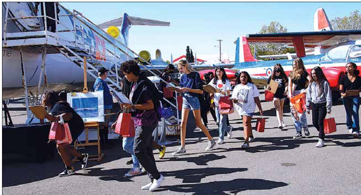
Girls from the region's school districts attended the 2nd annual STEM (Science, Technology, Engineering, Math) 'We Can Do It' day on Saturday, September 24, 2022 at the Aerospace Museum.