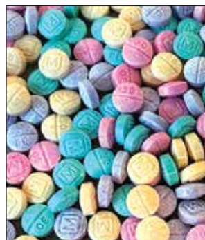
"Rainbow fentanyl can be found in many forms, including pills, powder, and blocks that can resemble sidewalk chalk or candy."