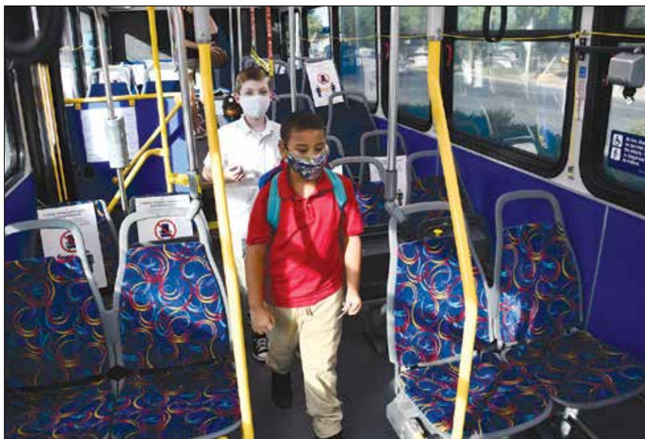
Anyone can ride SacRT for free between Saturday, October 1 and Friday, October 7, 2022.