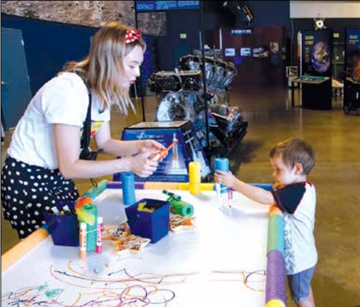
A ‘Rosie the Riveter’ teaches a child how to draw perfect circles at a demonstration spot at the Aerospace Museum on Saturday, September 24, 2022.

partners and Saturday was no exception. SJUSD paid for and provided the busses for enthusiastic junior high and high school students. SMUD brought giveaways and information. The Girl Scouts, a local robotic team, and volunteers from St. Francis High School in Sacramento also participated. ★