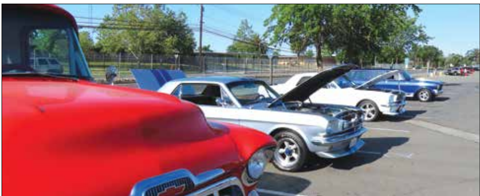
A view of the competing cars at this weekend's show.