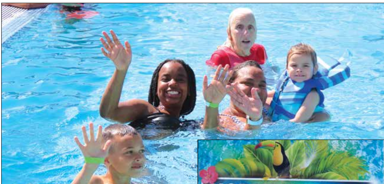
A group of happy swimmers pose for a photo at the grand opening of the North Natomas Aquatics Center on Saturday, April 23.