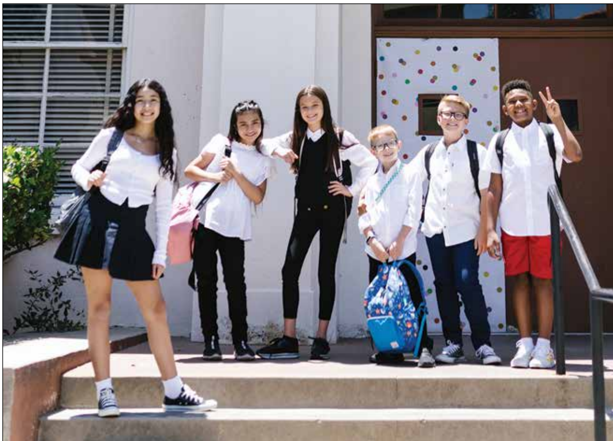
California backs away from COVID vaccine mandates for kids.