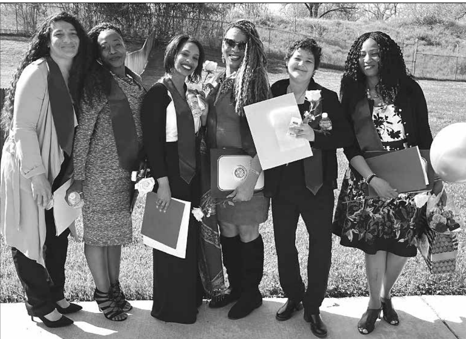
Six Sacramento women experiencing homelessness graduated from Women's Empowerment in March. The organization recently received funding from Kaiser Permanente Northern California Community Benefit Programs.