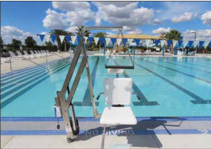
The new North Natomas Aquatics Center has a handicap sling that lowers a person in a wheelchair safely into the water