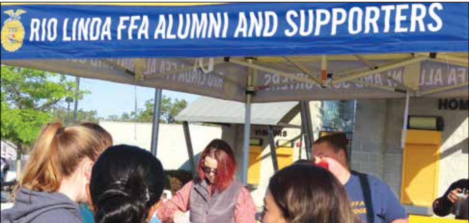
A crowd of interested people flock to learn about the FFA.