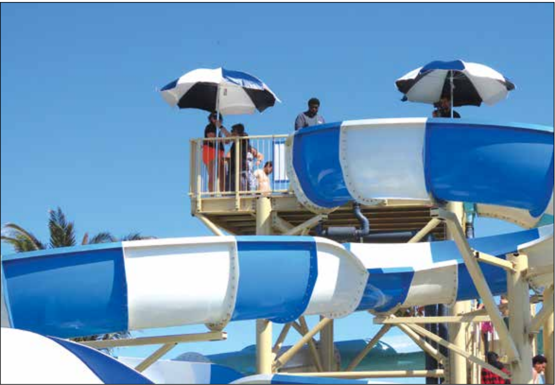
The new North Natomas Aquatics Center has a water slide that is fun for the whole family.