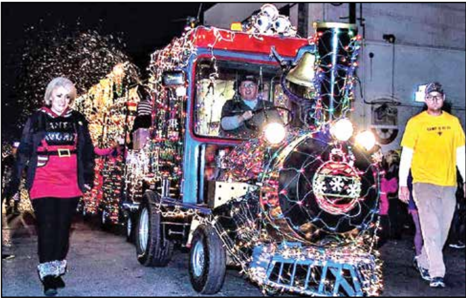
All Aboard! The Christmas Train is coming your way with lights and goodies for the kids.

Continued from page 1 about 32 entries in addition to standard entries that don't show up, such as Sue Frost, Metro Fire, Twin Rivers PD and Sac Sheriff. Entries are still being accepted! There are two marching bands scheduled, the Big Beat Drum Corp (a 6th grade band from Granite Bay) and the Citrus Heights Community Marching Band.