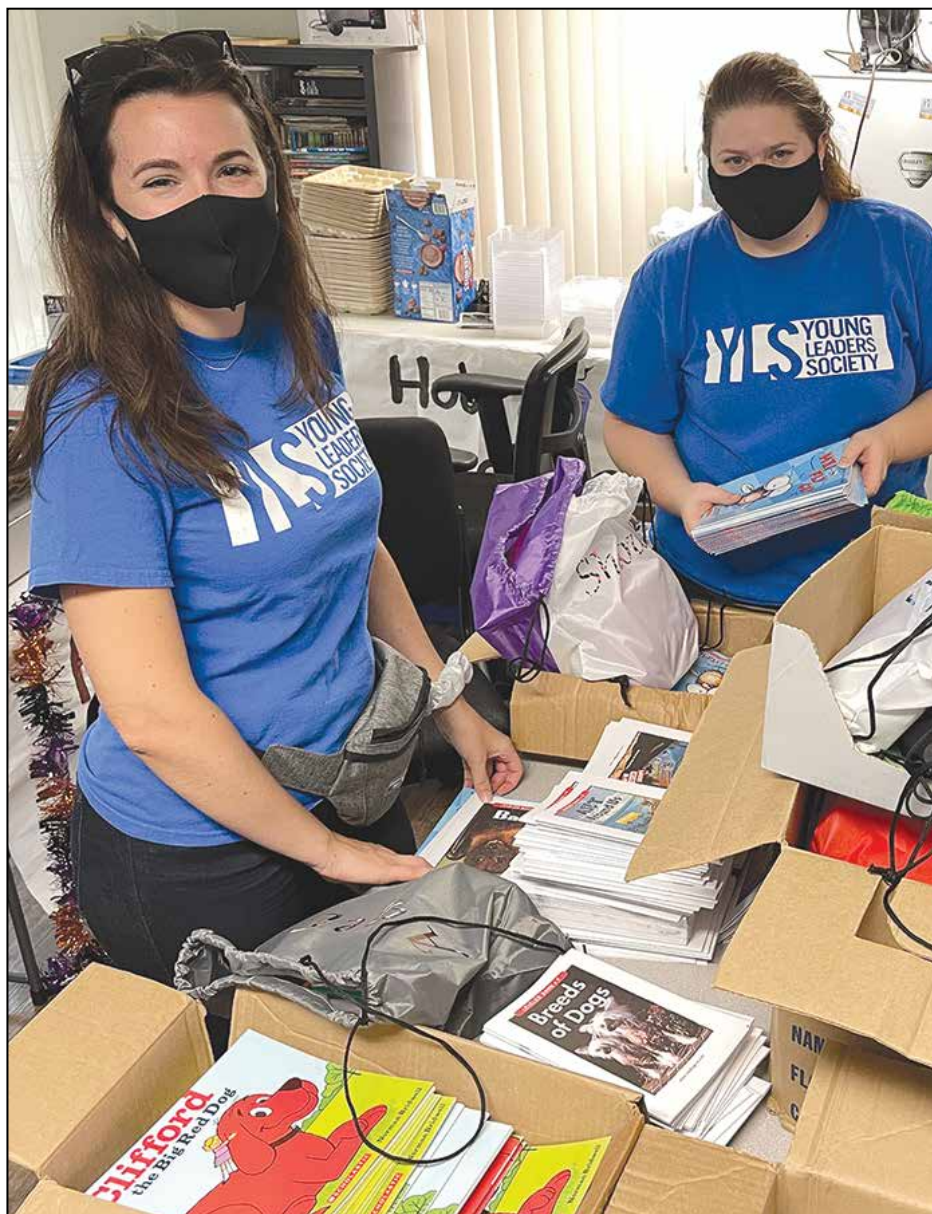
United Way California Capital Region volunteers collect items for a nonprofit partner in fall 2021. The group is asking residents to support its United We Shine campaign by supporting its local nonprofit partners.

Featured nonprofits include Community Housing Opportunities Corporation, St. Vincent de Paul Sacramento Diocesan Council, Urban Strategies Inc., Computers 4 Kids,