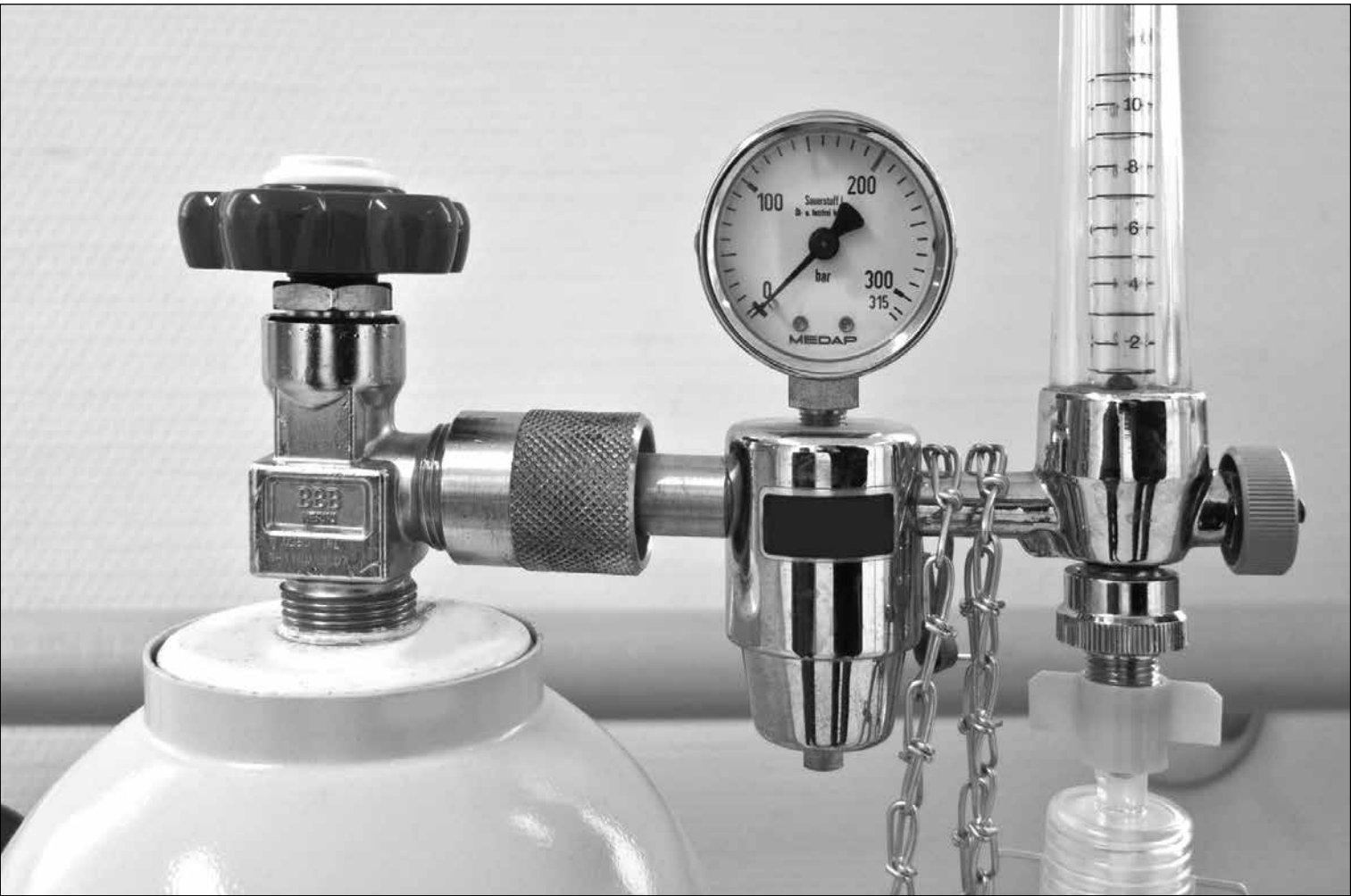
Waiting for a piece of medical equipment can be life-threatening.

tubing, nebulizers, canisters, oxygen, and PAP masks, has increased by 100%. Shipping container costs are partly to blame for these dramatic spikes. Since the pandemic began, the cost of these containers has risen over 1,200%. Then there's the chip shortage, which has disrupted production of everything from blood pressure monitors to remote-control hospital beds. When the price of inputs rises in other industries, companies typically pass the increase on to consumers. But home medical equipment providers are constrained by pre-determined