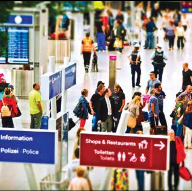
SMF wants travelers to know there are many ways to get to their destination without carrying on all the stress. Taking the time to plan ahead will help travelers get through the terminals with ease.

SACRAMENTO COUNTY, CA (MPG) - Demand for travel is back and this holiday season has the potential to be busier than ever. Online booking sites are predicting Thanksgiving passenger levels could be twice that of 2020 levels and 75 percent of 2019. Sacramento International Airport (SMF) wants travelers to know there are many ways to get to their destination without carrying on all the stress. Taking the time to plan ahead will help travelers get through the terminals with ease. Make a list of all travel essentials. Don't forget masks (more on that in a moment), antibacterial wipes and disinfectant; Pay attention to travel protocols. Depending on the destination, safety and vaccination requirements may be different than those at home; Transportation Security Administration (TSA) procedures have changed since the pandemic. Everyone is required to wear a mask and maintain social distance while in the security line and on the airplane, so bringing extra masks is recommended. Keep these helpful tips in mind when arriving at SMF: Parking: The East Economy Lot ($10/day), Daily Lot ($12/day), Garage ($18/day) and Hourly Lot ($29/day) are open for parking. Cash is no longer accepted at cashier booths in any parking lot. Customers paying with cash will need to do so prior to returning to their vehicle. Payment can be made at one of the self-service pay-on-foot