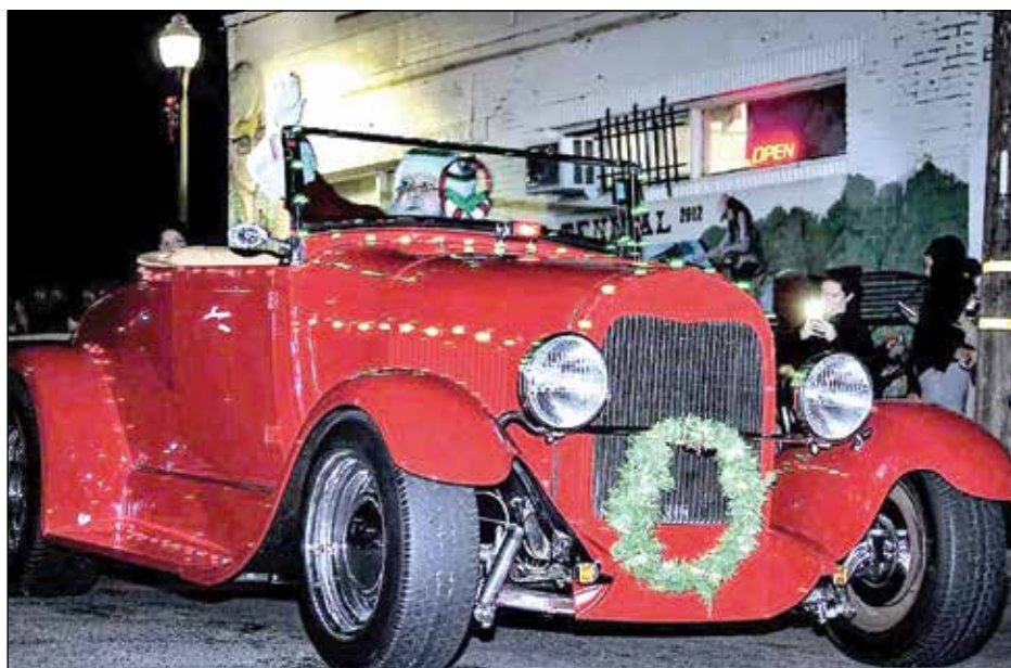
Beep, beep! Santa Claus is coming to Rio Linda!

Transportation) will begin closing the roads of the parade route between 3:00 and 3:30 pm on that day. DOT requires a 10 day notice for traffic disruption