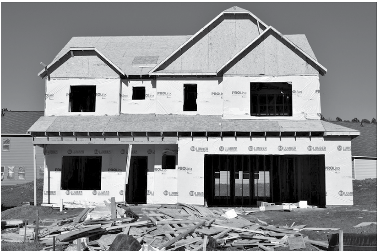
Panelists Expect New Home Sales in Sacramento Region Will Continue Increasing Through 2023, the North State BIA Reports

We are projecting over the next four years for the Sacramento MSA to